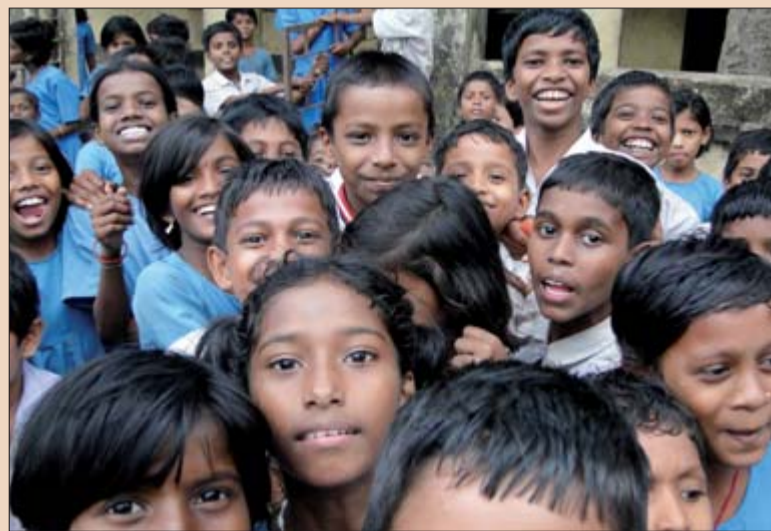
A group of Indian schoolchildren in Puri.

LUDHIANA, India: Calls for the introduction of compulsory morning sport sessions in Indian schools have been overshadowed by recent findings demonstrating a high incidence of sports-related injuries—including those to teeth and jaws—among Indian scholars. A study, conducted by researchers from the Department of Paediatric and Preventive Dentistry at Ludhiana's Christian Dental College in Northern India, found that approximately 25% of over 2,000 athletically active schoolchildren in Ludhiana had suffered from some form of sports-related injury to the face.