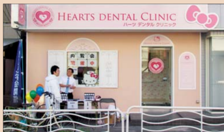
Tokyo's latest attraction is a dental clinic fully branded with the well-known Hello Kitty trademark. ▶ ASIA NEWS, page 3

Established in 2006, the IIUM's Faculty of Dentistry currently offers five-year Bachelor of Dental Surgery programmes. According to its website, 254 students are currently enrolled in the faculty, which makes it one of the largest dental institutions nationwide alongside the Universiti Sains Malaysia's School of Dental Sciences in Kubang Kerian and Penang International Dental College in Petaling Jaya. DTI