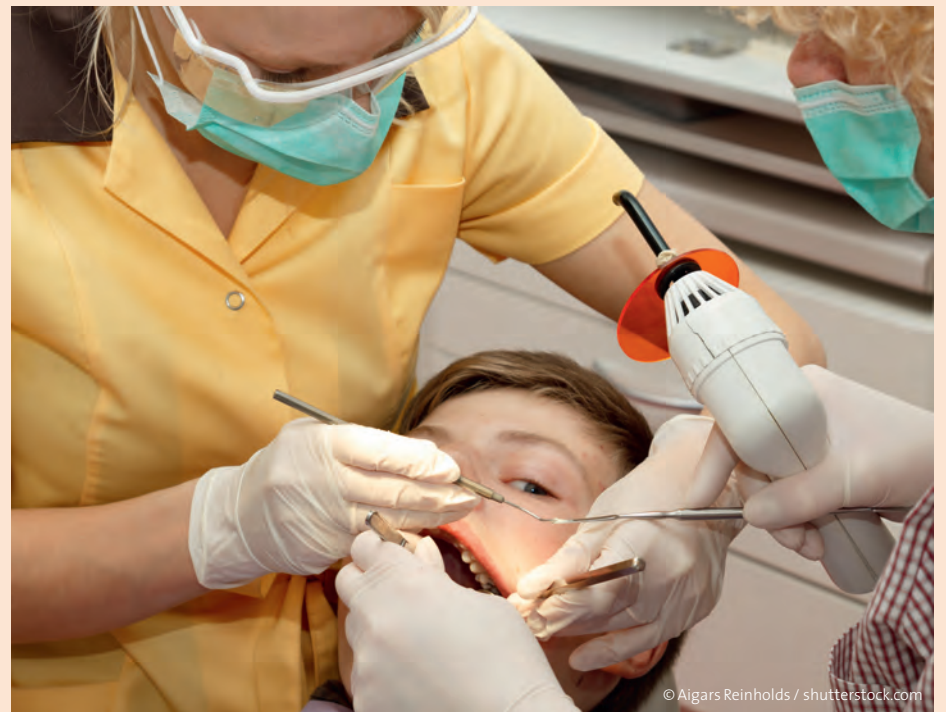
Hygiene therapists performed comparably to the GDPs in the study.