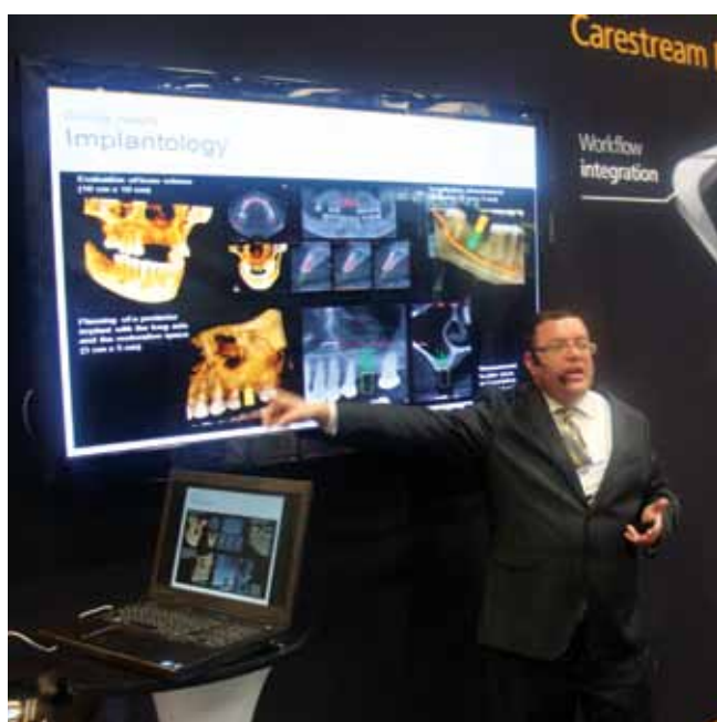
• A presenter offers educational information at the Carestream Dental booth (No. 4416) on Monday afternoon.