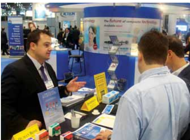
• Meeting attendees learn more about bone-grafting materials at the Implants booth (No. 3431).