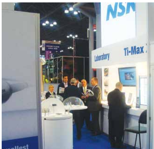
• The NSK booth (No. 3236).