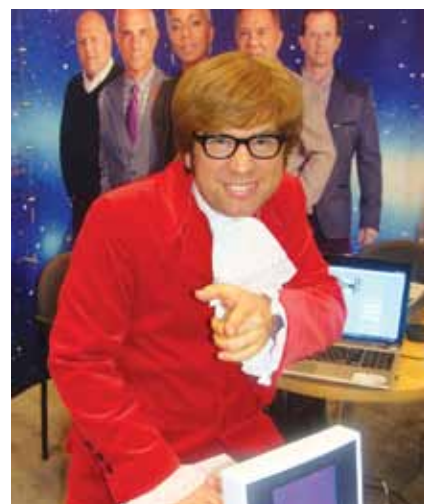
• He's back! To get your picture taken with Austin Powers, stop by Millennium Dental Technologies (booth No. 4033).