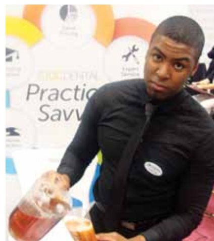
• Yes! They're serving Brooklyn Lager at DC Dental Supplies (booth No. 5201).