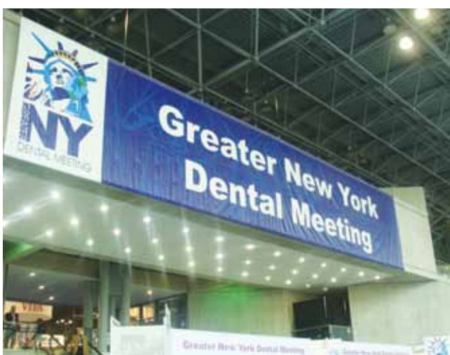
• If it's late fall, it's time for the Greater New York Dental Meeting.