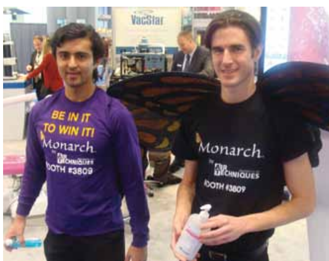
• These guys are wearing butterfly wings to help promote the Monarch line of infection control products available from Air Techniques (booth No. 3809).