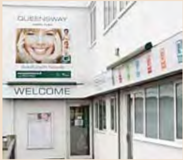
Queensway Dental Clinic

Queensway Dental Clinic in Billingham, Teesside has announced a new part-