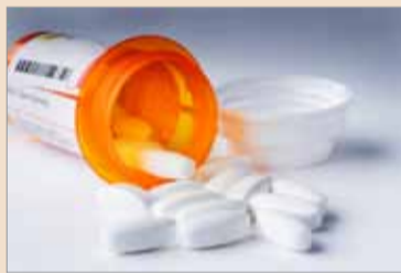
New cancer therapy

A new drug combination shows promise in reducing the risk for patients with advanced oral precancerous lesions to develop squamous cell carcinoma of the head and neck. The results of the study,