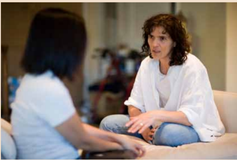
Dental complaints aren't as common as previously thought

A survey of more than 1,600 people across the UK has revealed how few patients think about complaining about their dental professionals.