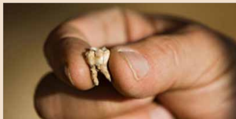
Teeth hold the key to bacterial change history

"Genetic analysis of plaque can create a powerful new record of dietary impacts, health changes and oral pathogen genomic evolu-