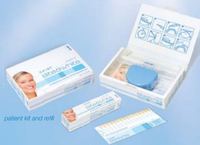
patient kit and refill