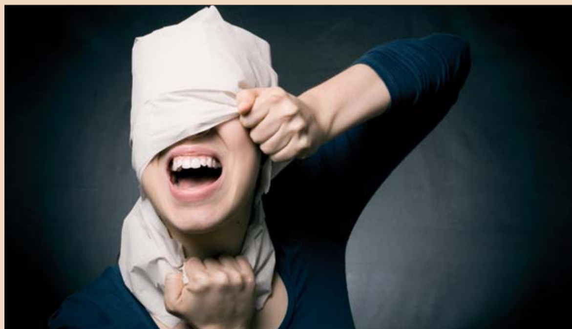
According to a study, more attention should be given to the oral health status of mentally disabled.

The alarming figures were released on the same day that new findings from Germany revealed that almost 40 per cent of Europeans suffer from some kind of mental health problem. According to the study, treating disorders like anxiety, insomnia or depression costs the Union an estimated US$594 billion a year, including costs for dental treatment.