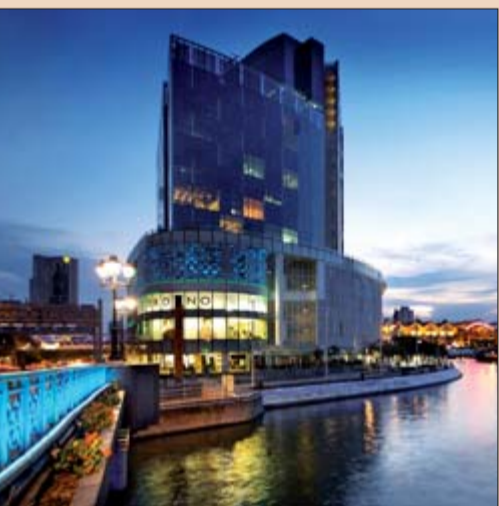
AmannGirrbach's new office as seen from the Coleman Bridge in central Singapore.

The new Singapore branch will support Amann's distribution partners in both regions through logistics and responsive customer service, the company said. It also announced plans for a help desk and company training centre to be established by the end of the year.