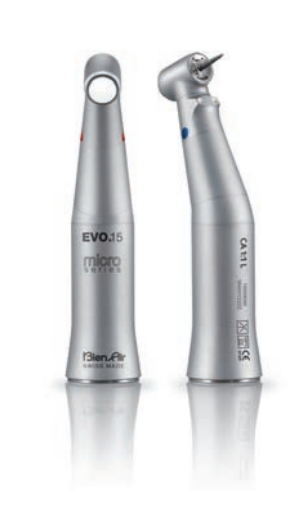
Bien-Air EVO.15 1:5 L (back) + EVO.15 1:1 L (left)