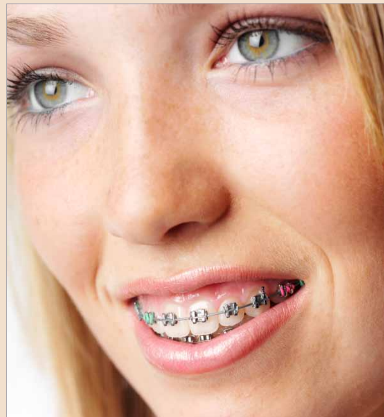
Clinical evaluations of fixed appliances