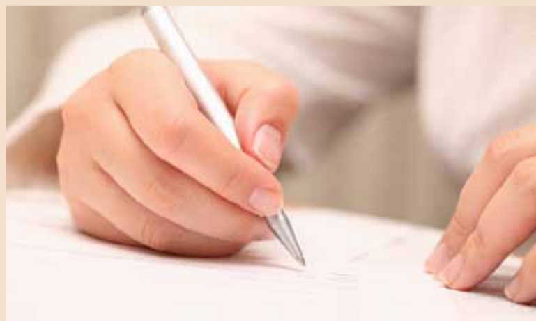
Health Service Ombudsman will be increasing their level of investigations