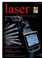
Cover image courtesy of Fotona, www.fotona.com