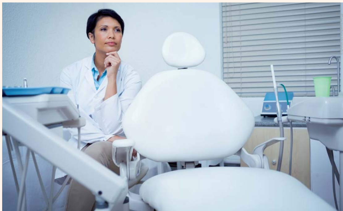
One in two dentist would not recommend dentistry as a career.

"There are huge stresses in the dental profession and great un-