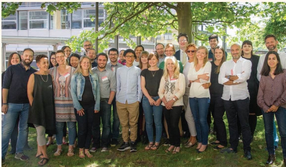
Almost 40 representatives of the DTI publishing group recently gathered in Germany.

Tribune International (DTI) publishing group. As the group's network and the dental industry are growing rapidly, a focus on content is more important today