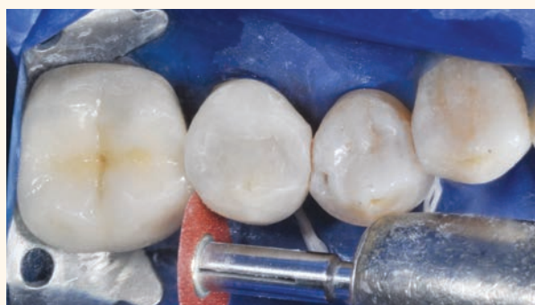
Fig. 8: Sof-Lex™ Discs were used to help contour interproximally