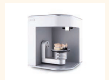
Scanner Identica (Medit)