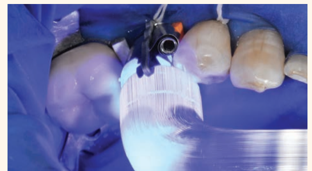
Fig. 7: It was then cured according to the Instructions for Use