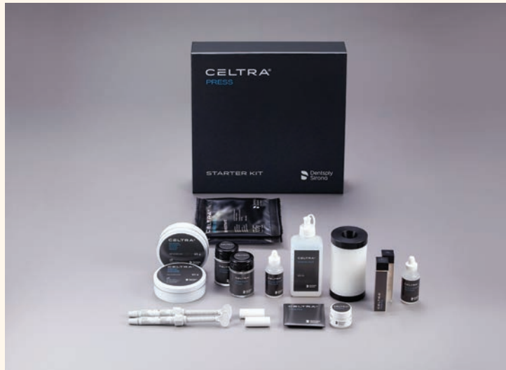
Celtra® Press, the new pressable, zirconia-reinforced lithium silicate as well as its veneering porcelain Celtra Ceram and Celtra Press Investment is available now

With its strength in excess of 500 MPa, Celtra® Press creates a new benchmark in the high strength