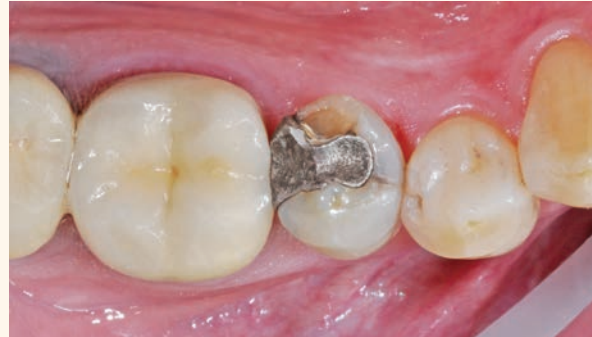
Fig. 1: Preoperative. Broken cusp and secondary decay are evident on this lower second premolar