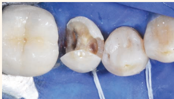
Fig. 2: The tooth has been isolated and prepared