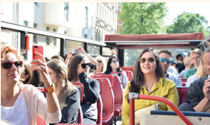
The tour covered Leipzig's major sights

is relaunching its website this year. Thus, another focus of the meeting was the further development of the new DTI website in order to make it a more effective tool for content provision that suits the needs of dental professionals all over the world. With improved usability and a modernised and interactive layout, the revamped website will feature the latest updates in dentistry, industry-related news, and upcoming webinars and global events.