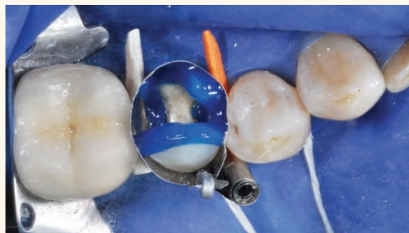
Fig. 3: Enamel is being etched using a selective etch approach. A universal adhesive will be used to etch and bond the dentin