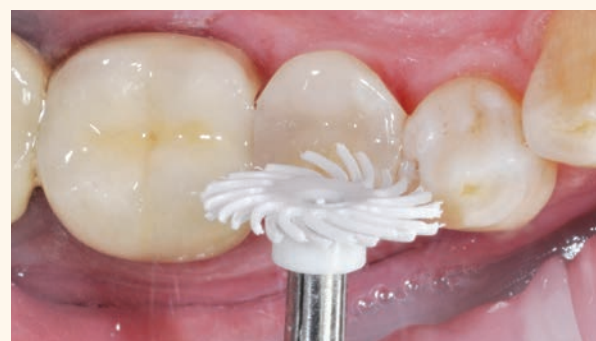
Fig. 9: Sof-Lex™ Spiral Polishing Wheel is excellent for polishing occlusal surfaces