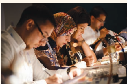
Delegates during the hands-on training