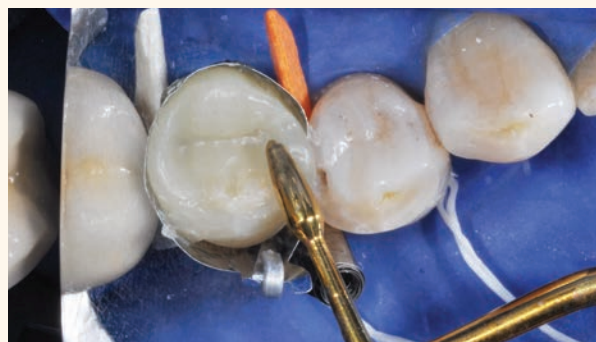
Fig. 6: Contouring was accomplished using traditional hand instruments