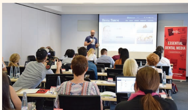
Veres presented a number of new features of the new Dental Tribune website