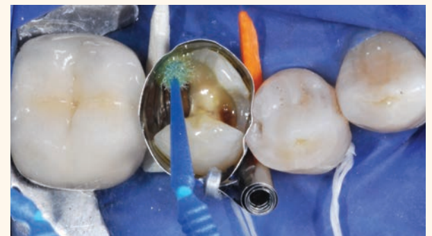
Fig. 4: After rinsing, Single Bond Universal Adhesive is being applied to the etched enamel and the unetched dentin. After solvent evaporation, the adhesive is light-cured