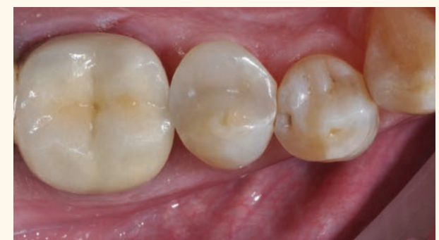
Fig. 10: The final restoration