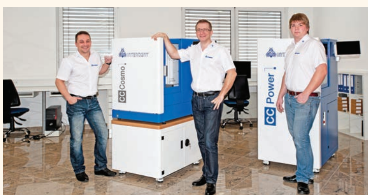
Interdent CAD/CAM Team

We are looking for dealers in different countries.