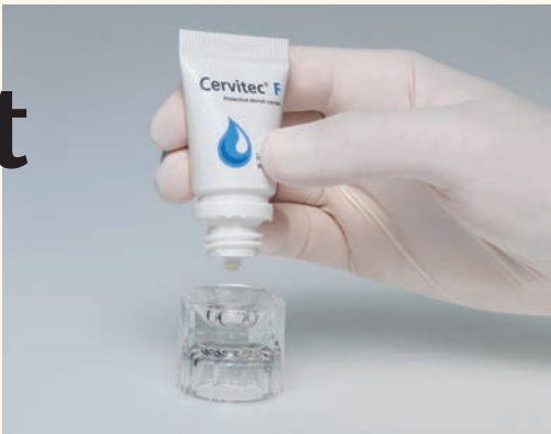
According to results from Ivoclar's recent survey of Cervitec F, the significant advantage of the combination product is that it saves time in the practice.