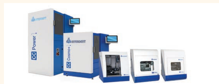
Milling units CC POWER, CC COSMO+, CC COSMO/COSMO STAR, CC TRENDY, CC CHIC

Every new technology takes time to perfect and find its way. Few years ago, Interdent paved the way for the CC POWER, CC COSMO+, CC COSMO/COSMO STAR, CC TRENDY and CC CHIC milling units, which will be available to users of various profiles. The needs of dental technicians across the world differ greatly and primarily depend on the existing capacities and development of a dental laboratory. The needs of a laboratory employing 200 people differ greatly from the needs of a laboratory employing 10 people. Since the company is focused on the international