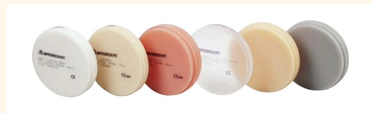
Wide range of discs for CAD/CAM: CoCr, Ti2, Ti5, Zr, Zr HT, Zr Smile, Zr Multicolour, wax, PMMA

market, it adopted a broad perspective during development (Fig. 1). This was the reason to make CC POWER, with its immense power of 2.5kW, available to the most demanding users, as it will be able to operate 24/7 maintaining productivity and precision, while the compact CC COSMO+ will be intended for medium-sized laboratories that will largely use the device for their own needs.