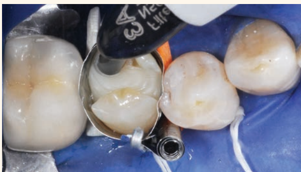
Fig. 5: Filtek™ Bulk Fill Posterior Restorative, shade A3 was then placed in a single increment