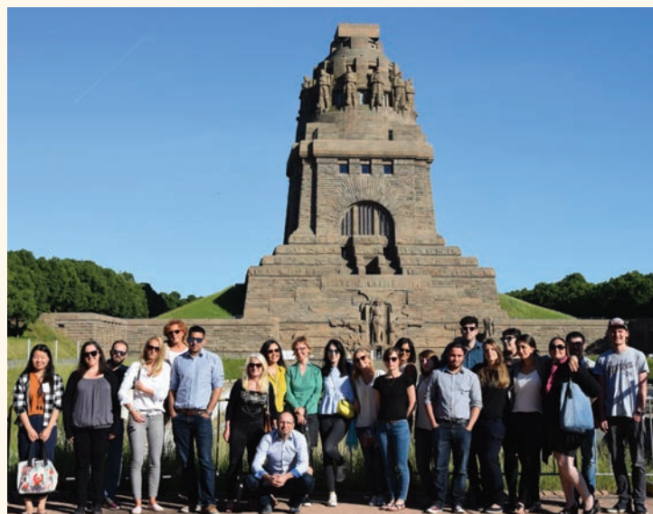
Stop at the famous Monument to the Battle of the Nations in Leipzig

than ever before. For this reason, editorial representatives from 20 countries recently came together for the first DTI Editors' Meeting.