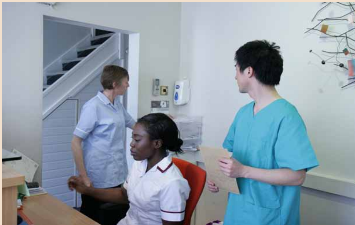
Practices are still awaiting the framework necessary for the commissions of services

A report from the recent Dental Law and Ethics Forum meeting