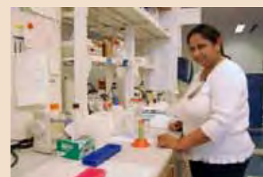
Bitter melon could treat head and neck cancer

Bitter melon, a vegetable that is a staple of diets in India and China, is also a folk remedy in those countries for treating diabetes. Metformin, a drug developed to treat diabetes, is used for cancer therapy. Ray hypothesised that a folk medicine for diabetes also might work to treat cancer. DT