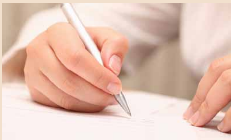
Health Service Ombudsman will be increasing their level of investigations

We want complaints to make a difference and help improve public services for everyone. There will be more opportunities for service providers to learn from complaints which can be used to improve public services. We still want complaints to be resolved locally wherever possible." DT