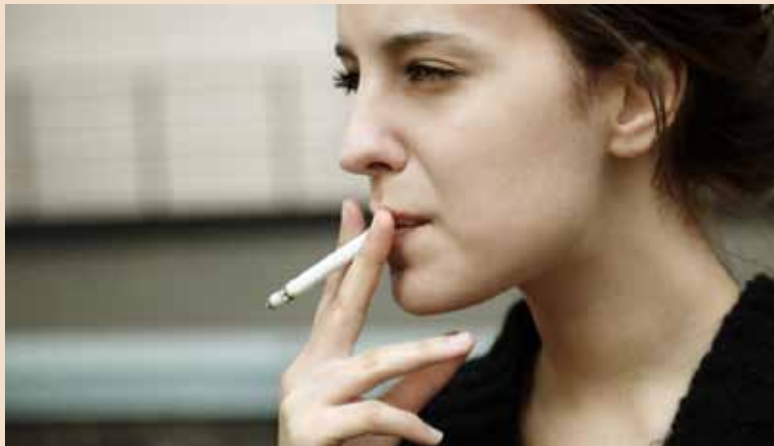
Almost 600 children a day take up smoking

Around 207,000 children aged 11-15 start smoking in the UK every year according to new research published by Cancer Research UK.