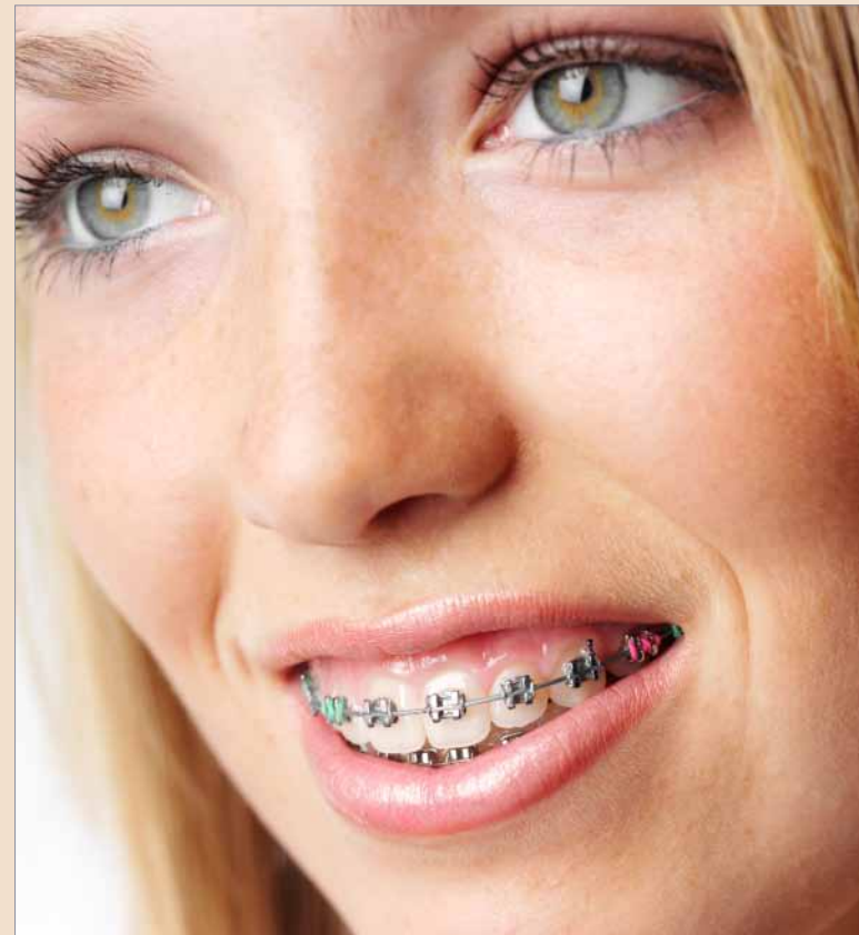
Clinical evaluations of fixed appliances