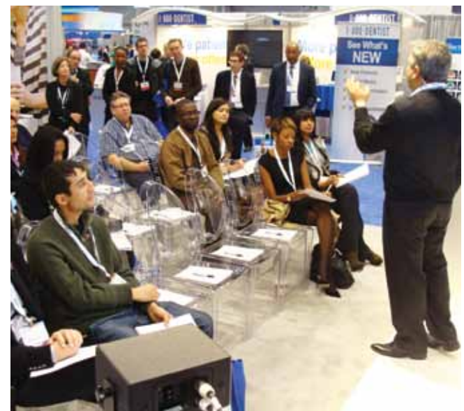
• Meeting attendees take in an educational presentation at the Invisalign booth (No. 2836).