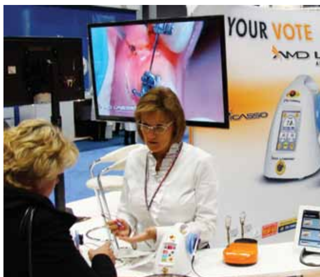
• A meeting attendee gets more information about laser technology at AMD Lasers (booth No. 4627).