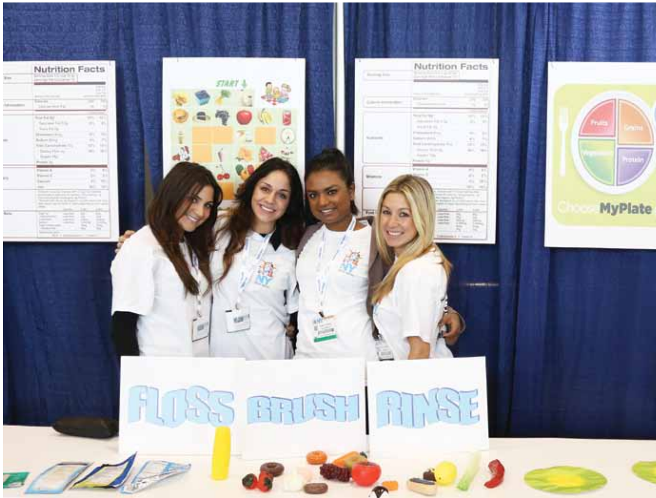
• New York University, New York City College of Technology and Hostos Community College provides hundreds of hygiene volunteers, such as these ladies above, who work with elementary school-age children during the 'Greater New York Smiles' program. The program, which runs through Wednesday, will educate about 1,500 local children. During the program, the children will learn all about nutrition, dental hygiene and brushing techniques. The children are given a dental report card to bring home as well as a goody bag filled with a toothbrush, toothpaste, a dental floss keychain, a notebook, crayons and an oral health-care coloring book.