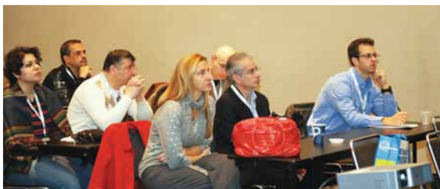
• Workshop attendees pay close attention during a Monday session.