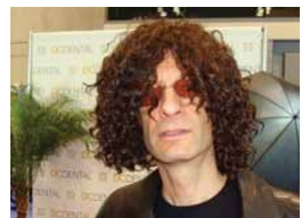
• You can get your picture taken with 'Howard Stern' at the DC Dental Supplies booth (No. 4000). 'Joane Rivers' was spotted there, too.