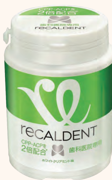
Big in Japan: RECALDENT gum is the largest selling sugar-free gum in the Asian country. Furthermore, Japanese dental company GC has incorporated RECALDENT into a wide range of products.