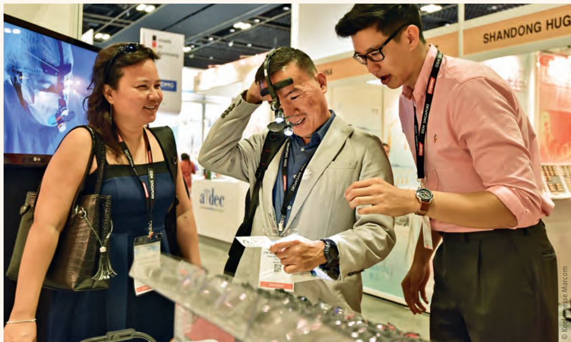
Hosted at the Suntec Singapore Convention and Exhibition Centre, IDEM 2018 will be held under the theme "Striving for clinical excellence".

Online registration for IDEM 2018 is now open at www.idem-singapore.com .