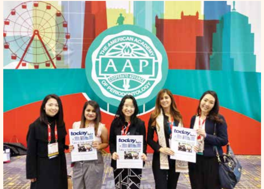
Attendees of the 2019 AAP Annual Meeting take a picture on the first day of the show. This year's meeting takes place from Thursday, Nov. 4 to Sunday, Nov. 7, in Miami Beach, Fla.

The AAP is closely monitoring the COVID-19 pandemic to ensure the utmost safety of all 2021 Annual Meeting at-