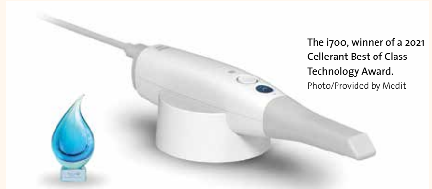
The i700, winner of a 2021 Cellerant Best of Class Technology Award.