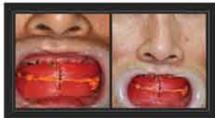
Figure 1. Acquisition of jaw relationship and vertical dimension for the prosthetic restoration of maxillary and mandibular implants using wax rims fabricated after impression taking.

When complete dentures are used as temporary prosthetics after implant placement, wax rims are normally used to obtain a final impression and then to convey information about the patient's jaw relationship and vertical dimension to