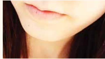
Study reveals many people avoid smiling because they don't like their teeth.

The study also reveals several darker data points illustrating the poor oral health habits of some respondents, based