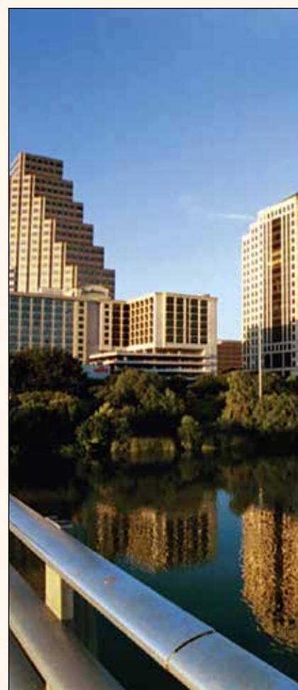
The 2022 ADSO Summit will take place from March 29 to April 1 in Austin, Texas.