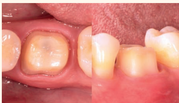
Fig. 8: Situation at intraoral try-in of the crown. It is made of a 3M™ Lava™ Zirconia coping and an IPS e.max® Ceram (Ivoclar Vivadent) porcelain layer. Ideal intraoral conditions (smooth margins, healthy tissues) are visible.