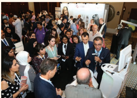
Delegates during the CME sessions at the exhibition