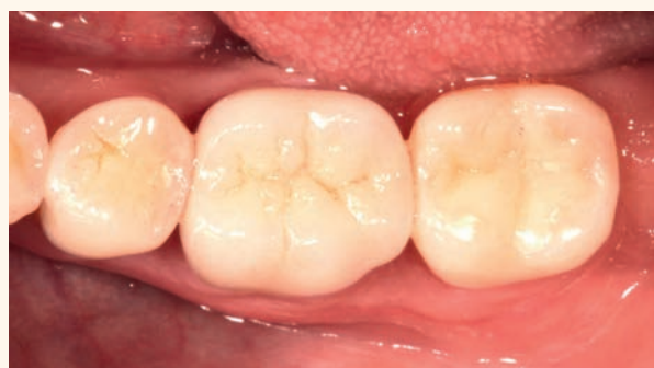
Fig. 10: Situation after crown placement, removal of the excess cement and thorough cleaning. The crown blends in nicely with the surrounding tooth structure.