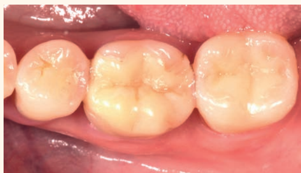
Fig. 2: Due to the size of the restoration, the amount of remaining tooth structure might not be sufficient to ensure the required stability for a direct composite restoration.