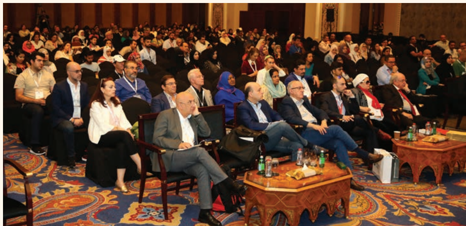
Delegates and visitors during the 13th CAD/CAM & Digital Dentistry Conference & Exhibition in Madinat Jumeirah Conference & Events Centre in Dubai, UAE