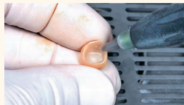
Fig. 9: Sandblasting of the crown's intaglio surface to create a microretentive surface structure that is beneficial for cementation. This procedure is recommended for oxide ceramic materials.