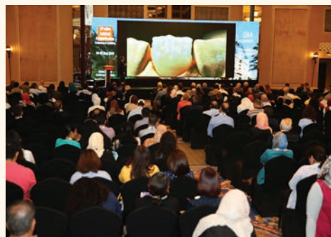
Delegates during the scientific programme