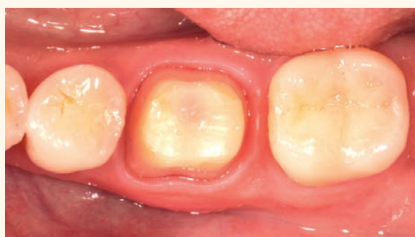
Fig. 5: One week after the preparation procedure, healthy soft tissue conditions are obtained. They lay the foundation for a high-quality precision impression.