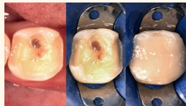
Fig. 3: Upon removal of the old filling, it becomes clear that a crown is needed to ensure the required stability. The tooth is built up with 3M™ Filtek™ Bulk Fill Posterior Restorative, which may be placed in conjunction with 3M™ Single Bond Universal Adhesive and in increments of up to 5 mm.