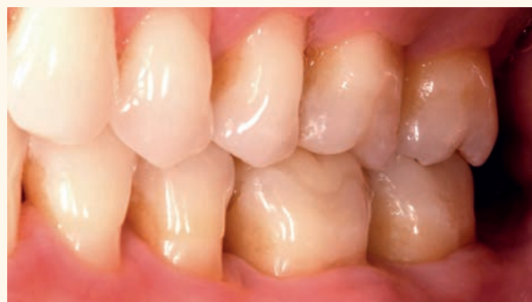
Fig. 1: Initial situation. The failed composite restoration covering a large part of the left mandibular first molar's occlusal surface needs to be re-placed.

The featured 3M product may be known with an alternative name in different regions. 17