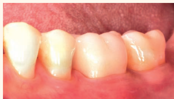
Fig. 11: At the check-up several days after crown placement, a great overall picture is obtained. The patient is happy with the final restoration in terms of aesthetics and function.

3M, Filtek, Impregum, Lava, Penta, Protemp and RelyX are trademarks of 3M or 3M Deutschland GmbH. Used under license in Canada. All other trademarks are owned by other companies.