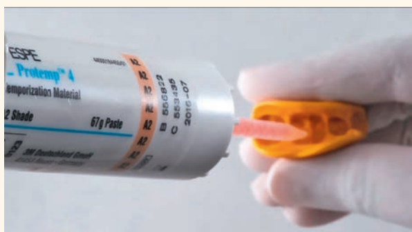
Fig. 4: Following tooth preparation, a temporary crown is produced chairside with 3M™ Protemp™ 4 Temporization Material. This material exhibits a high strength and a natural gloss without polishing.