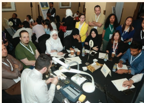
Delegates during the Round Table Training at DTIM