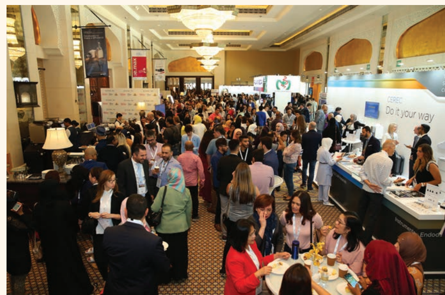
Delegates and visitors during the 13th CAD/CAM & Digital Dentistry Conference & Exhibition in Madinat Jumeirah Conference & Events Centre in Dubai, UAE

gated at the Madinat Jumeirah Conference Centre in Dubai from 4 to 5 May to share in the latest developments, innovations and ideas that have transformed the field of den-