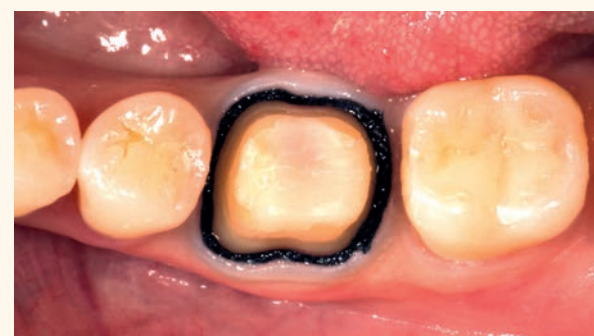
Fig. 6: In order to allow for a detailed capture of the preparation margin, the gingival tissues are retracted using the double-cord technique. Alternatively, a single cord may be applied in combination with 3M™ Astringent Retraction Paste.