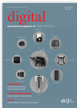
Cover image courtesy of Chesky/Shutterstock.com