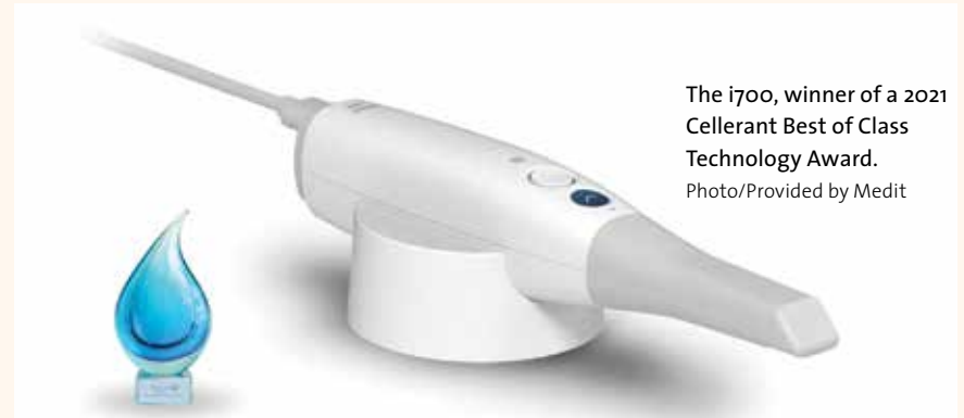
The i700, winner of a 2021 Cellerant Best of Class Technology Award.