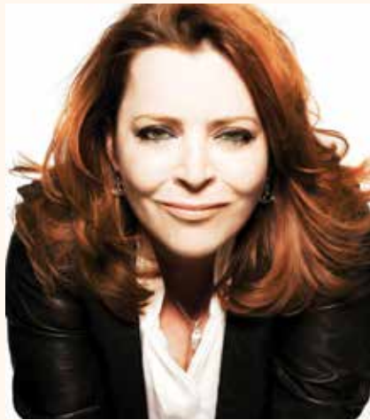
Comedian Kathleen Madigan will be featured at the Hinman Dental Meeting's keynote session in March.