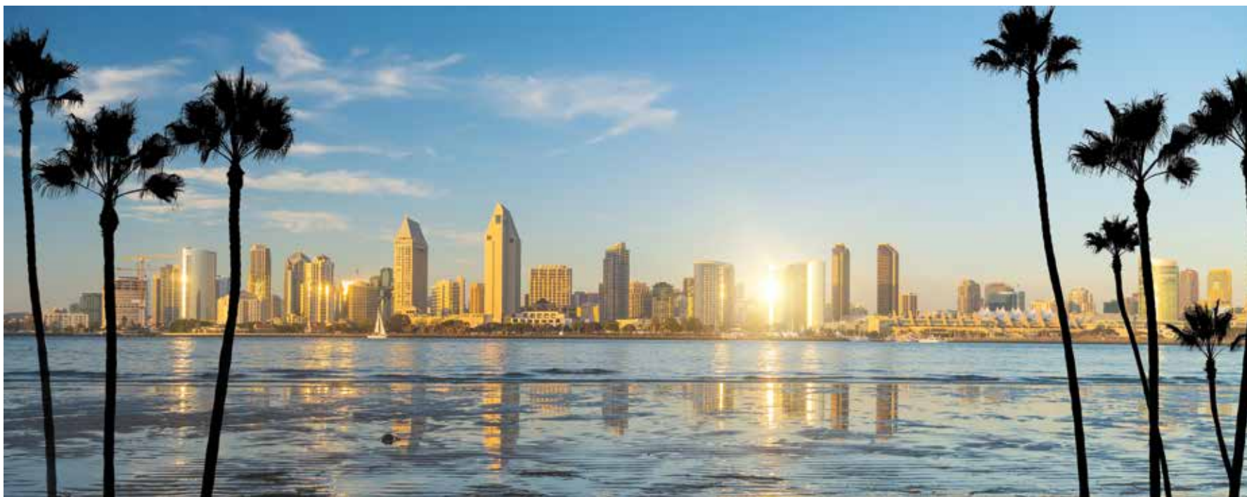
The 2022 AO Annual Meeting will return live and in-person from Feb. 24 to 26 and will take place at the San Diego Convention Center.