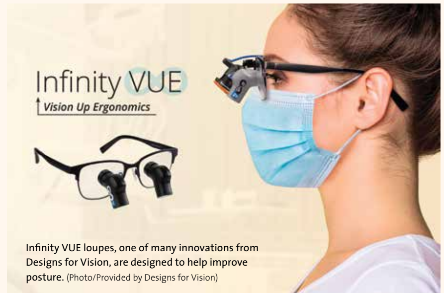
Infinity VUE loupes, one of many innovations from Designs for Vision, are designed to help improve posture.

Designs for Vision is also introducing patented (US pat. 8,851,709 & RE46,463) hands-free infrared technology with the WireLess IR HDi and the Micro IR HDi headlights. The patented IR feature allows you to operate the headlight