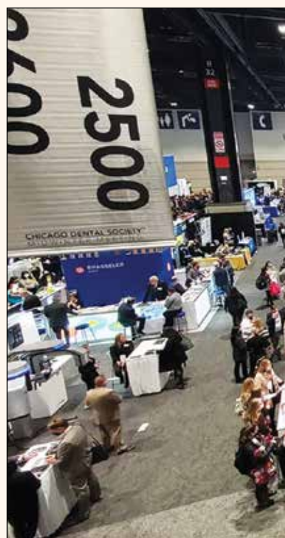
Attendees stroll through the Chicago Midwinter Meeting exhibit hall during the 2022 show. This year, the meeting is being held Thursday, Feb. 23 to Saturday, Feb. 25.