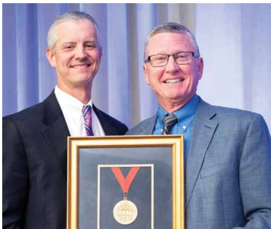
AAP award recipients are celebrated at a ceremony during the AAP's 108th annual meeting in Phoenix.