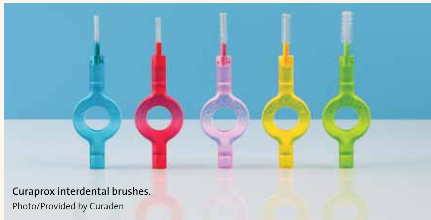
Curaprox interdental brushes.

The percentage of the test sites bleeding on interdental brushing was reduced from 68 percent to 10 percent, a reduction of 85 percent.