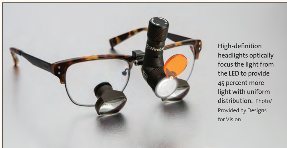
High-definition headlamps optically focus the light from the LED to provide 45 percent more light with uniform distribution.

You also can arrange a visit in your office by contacting the company at (800) 345-4009 or via info@dvimail.com .