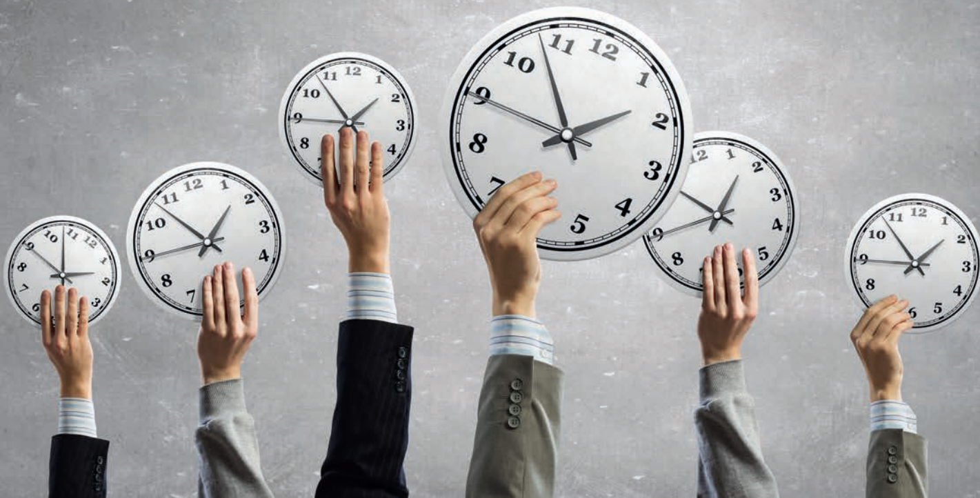
Time management—there simply do not seem to be enough hours in your day.