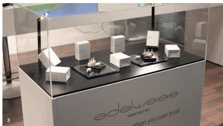
3 The newly launched edelweiss CAD/CAM BLOCK showcased at IDS. 4 The edelweiss dentistry booth at IDS 2023.

More information on the edelweiss dentistry products can be found at www.edelweissdentistry.com . ◀