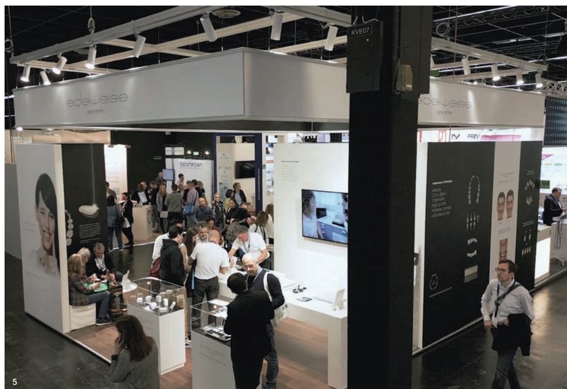
5 IDS 2023 offered the edelweiss dentistry team the opportunity to network with industry professionals from all over the world.