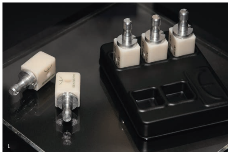
1 The edelweiss i-BLOCK with integrated screw channel. 2 The edelweiss DIRECT VENEERS and OCCLUSIONVD system.

He added: “Its outstanding, long-lasting shine and strength make it currently the best option for both anterior and posterior CAD/CAM restorations. This block is setting a new