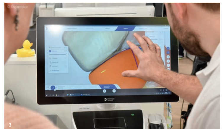
2 Dentsply Sirona presented interactive events, exciting digital experiences and live demonstrations at IDS. 3 Trade show attendees experienced the digital universe at Dentsply Sirona's booth.