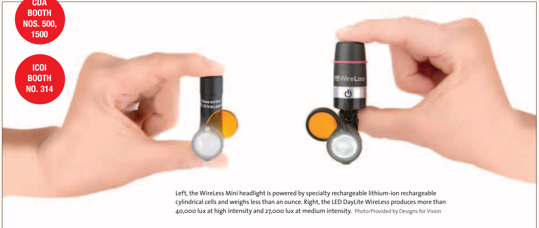
Left, the WireLess Mini headlight is powered by specialty rechargeable lithium-ion rechargeable cylindrical cells and weighs less than an ounce. Right, the LED DayLite WireLess produces more than 40,000 lux at high intensity and 27,000 lux at medium intensity.