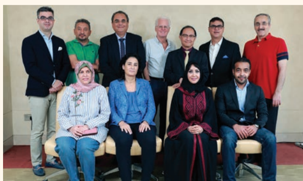
Dental Toothpaste Consensus 2017

"Thank you again for inviting me to this great meeting, it was a real honor to be part of this well organised event."