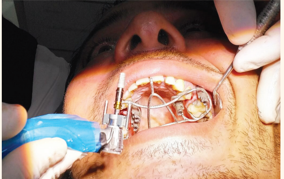
The open design of the guide gives great visibility and allows cooling

Our primary product line remains PFM crowns and bridges. However, since we last met, we have introduced two new products: Removable Partial Dentures and Metal Surgical Guides. The RPDs which we produce are a great solution for a partially edentulous patient who is not a candidate clinically or financially for implants. We use a metallurgical process called Solution Annealing which brings flexibility into our metal and helps with the fit for the patient. The second product is a metal 3D printed Surgical Guide. This is a really exciting innovation in Surgical Guides and we recently collaborated on a trial surgery to test the product in the Middle East region for the first time.