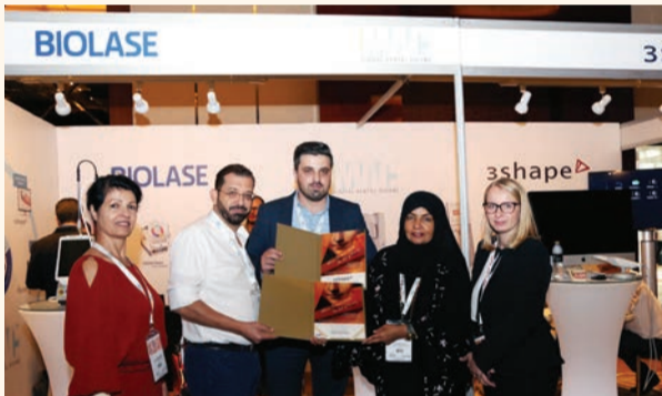
Gold Sponsor MAC Digital & 3Shape