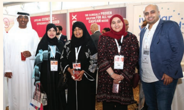
Delegates from Ministry of Health and Emirates Dental Society