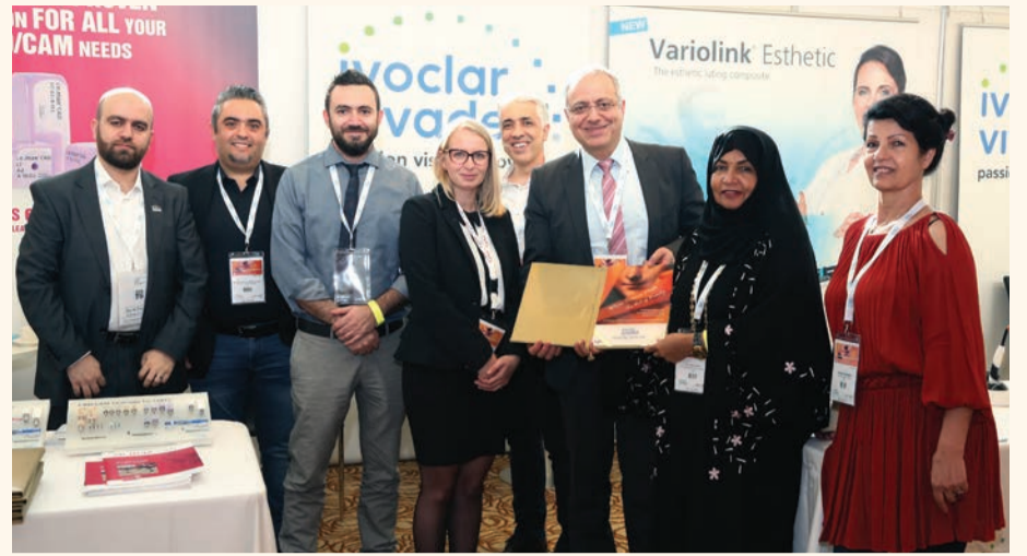
Ivoclar Vivadent was once again Crystal Sponsor during the 9th DFCIC