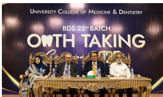
Future dental professionals take their solemn oath at the University College of Medicine & Dentistry, UOL Lahore, marking the beginning of their journey toward becoming compassionate and ethical dental surgeons.

The oath-taking ceremony for BDS students is a time-honored tradition that serves as the official entry into the world of dental practice. It symbolizes the commitment of future dental professionals to uphold the ethical standards,