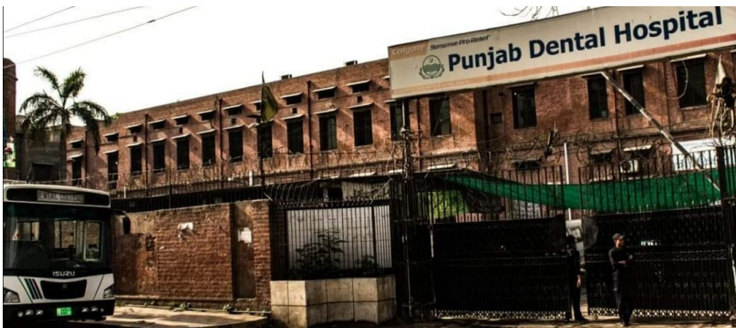
The de'Montmorency College of Dentistry, a cornerstone of dental education in Pakistan, stands as a symbol of academic excellence. The Pakistan Dental Association advocates for its upgrade to the de'Montmorency University of Oral Health Sciences, ensuring its continued independence and leadership in advancing dental education and research.

In lieu of the merger, the Pakistan Dental Association has recommended upgrading de'Montmorency College to the de'Montmorency University of Oral Health Sciences. This upgrade would not only preserve the college's esteemed legacy but also propel the advancement of dental education and research, ensuring its continued leadership in the field.