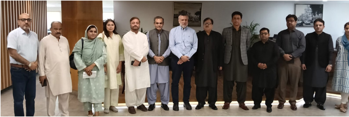
Key leaders from the Pakistan Dental Association (PDA) Karachi and the Sindh Healthcare Commission (SHCC) unite for a strategic meeting to streamline dental clinic registration, promote clinical compliance, and combat quackery.

KARACHI: The Pakistan Dental Association (PDA) Karachi and the Sindh Healthcare Commission (SHCC) have launched a strategic collaboration to enhance dental healthcare regulation in Sindh, focusing on dental clinic registration, practitioner training, and combating dental quackery.