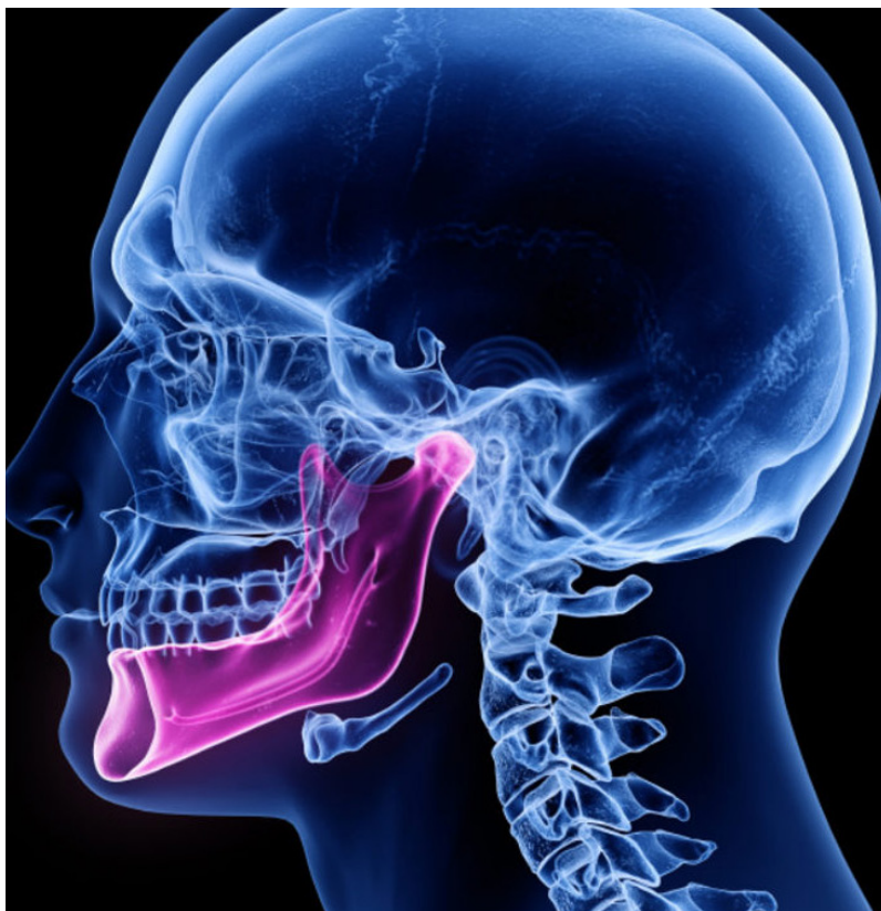
An X-ray highlighting the temporomandibular joint (TMJ), where clenching or Dental Compression Syndrome (DCS) exerts vertical forces, causing significant strain on the joint and its disc.

Unlike grinding, which produces horizontal forces, clenching creates vertical forces that can exceed twice the intensity of grinding. These forces last much longer, causing significant wear and tear on the TMJ.