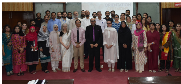
A memorable moment as JMDC's faculty and the bright new faces of BDS Batch 27 come together to celebrate the start of an inspiring academic journey. The grand orientation ceremony marks the beginning of a path filled with knowledge, ethics, and service to humanity.