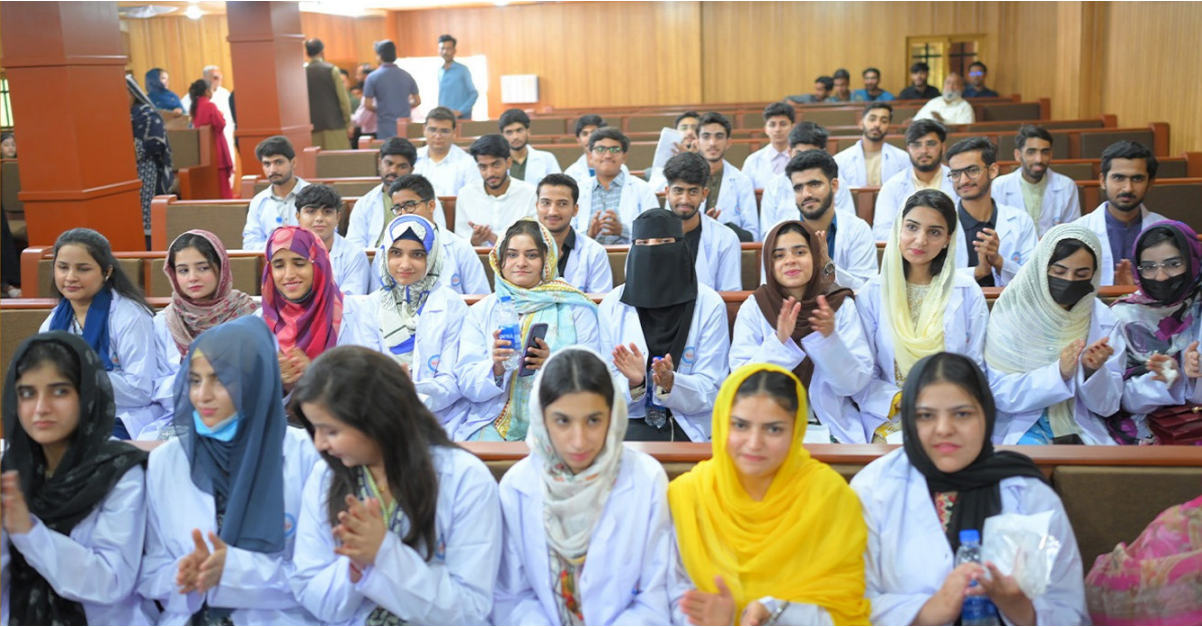
New Beginnings with Applause: BDS freshmen at Bhitai Dental & Medical College, Mirpurkhas, enthusiastically cheer as speakers deliver inspiring messages during the official welcome ceremony.

MIRPURKHAS: Bhitai Dental & Medical College, Mirpurkhas, proudly organized a special welcome ceremony for its newest batch of Bachelor of Dental Surgery (BDS) students, marking the start of a promising