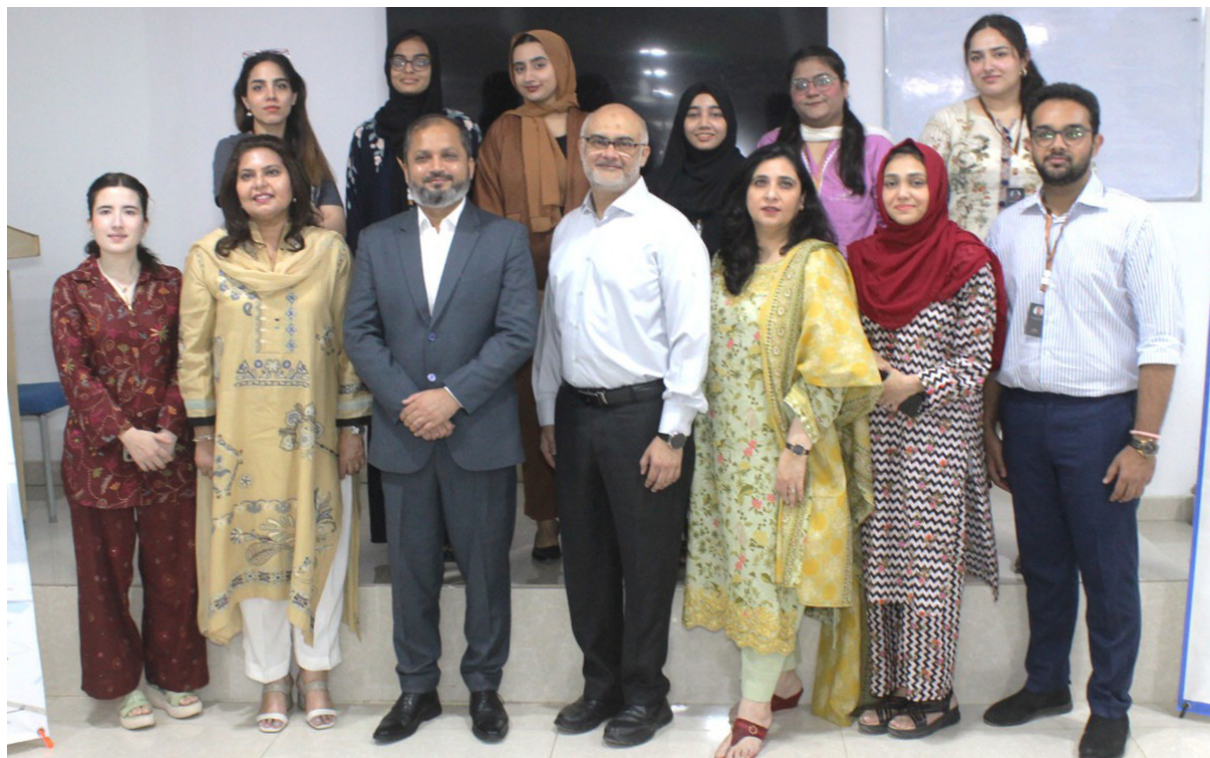
Shaping the future of dental research: Participants at the IDRP Pakistan Orientation hosted by the Altamash Institute of Dental Medicine. This event marks a key step in fostering international collaboration and empowering the next generation of dental researchers in Pakistan.