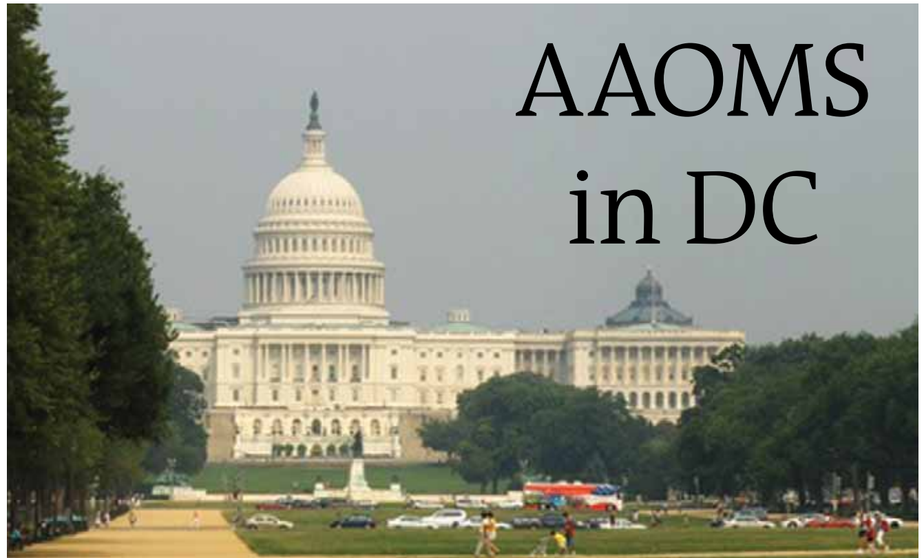
The AAOMS 97th Annual Meeting will take place Sept. 28–Oct. 3 at the Walter E. Washington Convention Center in Washington, D.C.