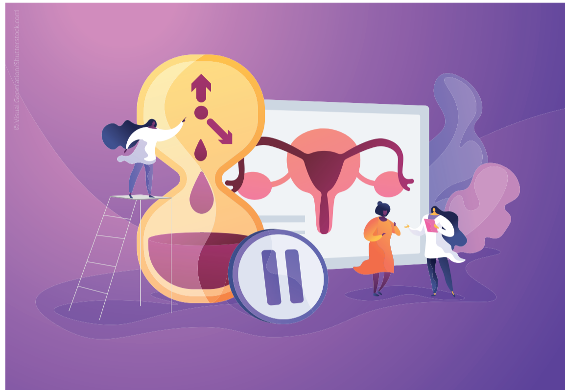
In order to educate the dental community about the challenges that menopausal women face in the workplace, the British Association of Dental Nurses launched a menopause policy at the beginning of this year.

Editorial note: More information on the BADN, how it supports dental nurses and the benefits of a membership can be found at www.badn.org.uk .