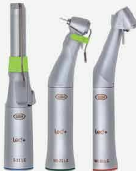
Mini LED +