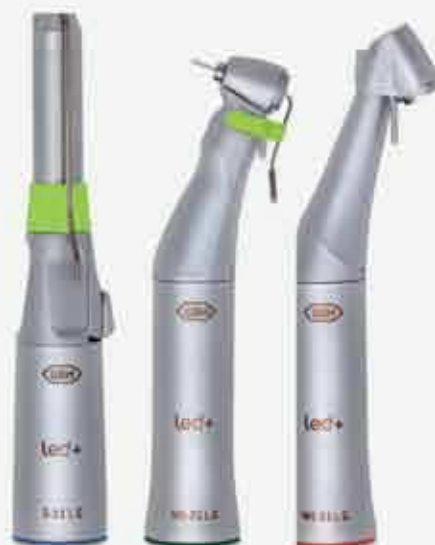
Mini LED +