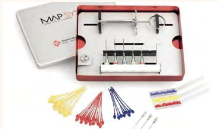
The MAP System provides a unique and efficient method for placing root canal repair materials in orthograde or retrograde obturation.

The MAP System is available in three kits (Intro, Universal and Surgical), which each contain a Swiss-quality stainless-steel sy-