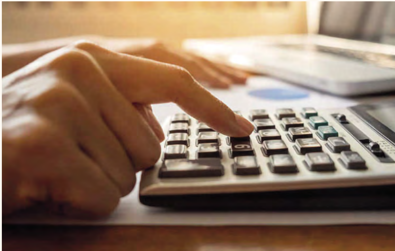
The annual survey by the Australian Dental Association to summarise fees charged by its private practice members has indicated that fees have increased slightly.

As with previous years' surveys, less than a quarter of GPs reported