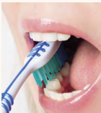
New research suggests that brushing one's teeth less than twice a day for less than 2 minutes at a time may lead to a threefold increase in risk of developing cardiovascular disease.

The study, titled "Emotions experienced during the shedding of the first primary tooth", was published online on 15 September 2018 in the International Journal of Paediatric Dentistry ahead of inclusion in an issue.