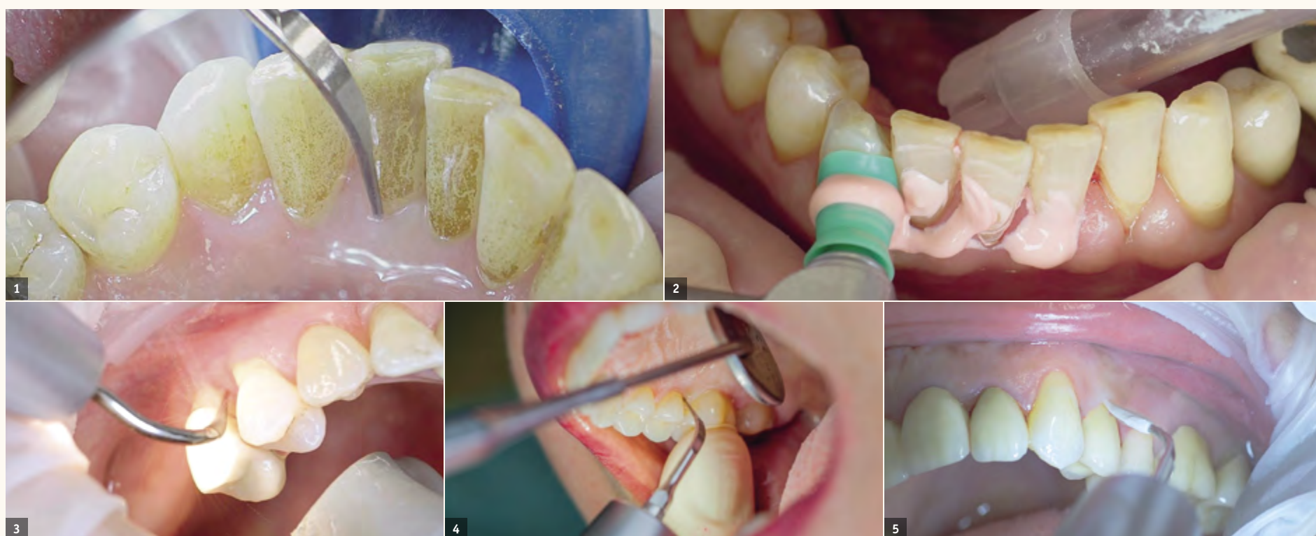
Fig. 1: Calculus removal using an ultrasound (W&H Tigon (+) with a 3U tip) is a key part of professional tooth cleaning. (Photograph: W&H) Fig. 2: Rotary cleaning with prophylaxis polishing cups and brushes (W&H Proxeo prophylaxis contra-angle handpiece) ensures smooth surfaces on teeth. It enables patients to check biofilm effectively at home. (Photograph: W&H) Fig. 3: If marginal periodontitis is diagnosed, the initial debridement can be carried out very efficiently with an air scaler (sonar technology, W&H Proxeo with 1AP tip). (Photograph: W&H) Fig. 4: Ultrasound devices are particularly suitable for UPT, for example in combination with periodontal tips (W&H Tigon (+) with 1P tip). (Photograph: W&H) Fig. 5: Implants and suprastructures are routinely cleaned, for example using ultrasound devices and special plastic instruments (W&H Tigon (+) with 1I tip). (Photograph: W&H)

Definitively integrating abutments or other components at implant level immediately ("one abutment, one time") has also proved to be effective. 30 In combination with good hygiene and correspondingly healthy tissue, this concept can probably be used to achieve a more stable attachment of the implant to the oral cavity than if the components have to be replaced several times - a requirement for peri-implant health.