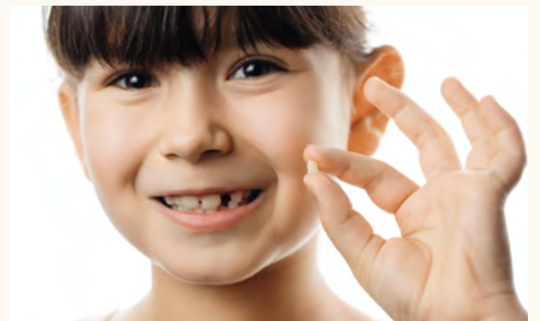
Researchers from the University of Zurich have found that children mostly experience the loss of their first primary tooth as something positive.

Moreover, the study found that socio-demographic factors are related to children's feelings. For example, children were more likely to have positive feelings such as pride or joy if their parents had a higher level of education and came from non-Western countries. The researchers indicate that cultural differences could be at play here. These include education style and norms that parents pass on to their chil-