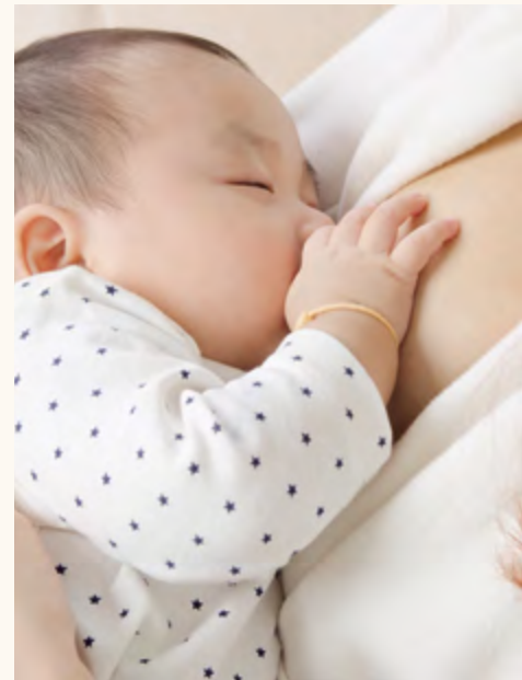
A recent study conducted by the Queensland University of Technology demonstrated that breastfeeding improves the oral immune system of newborns.

For the recent study, a variety of microorganisms were exposed to breastmilk and saliva mixtures. The results showed that inhibited growth of the microorganisms took place immediately and for up to one day regardless of whether the microorganisms were considered pathogenic or commensal in an infant's mouth.