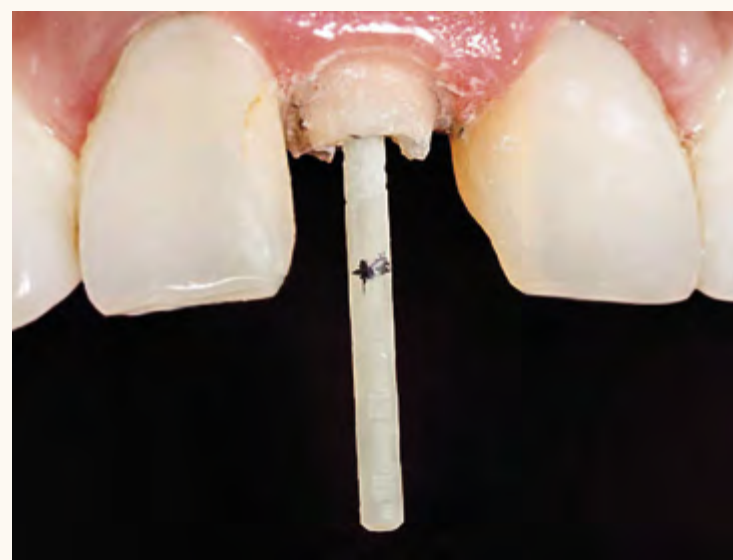
A recent study found that placing a CAD/CAM-integrated glass fibre post and core decreases the risk of fracture of an endodontically treated and restored tooth.

The study, titled "Fracture behaviors of maxillary central incisors with flared root canals restored with CAD/CAM integrated glass fiber post-and-core", was published online in Dental Materials Journal on 1 November 2018 ahead of inclusion in an issue.