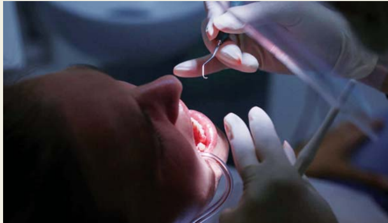
A new review study has concluded that patients with periodontal disease may have an increased risk of developing COVID-19-related respiratory complications.

by performing a scaling and root planing procedure on a patient with periodontal disease, we can lower IL-6 levels by, on average, 3 pg/ml," Molayem told Dental Tribune International.