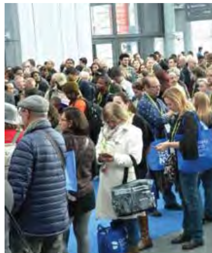
• Minutes away from the 9:30 a.m. opening Sunday morning, attendees line up in the Javits Center crystal palace at the entryways to the Greater New York Dental Meeting exhibit hall.

These are just a few examples among thousands. The endless education and shopping opportunities continue through Wednesday.