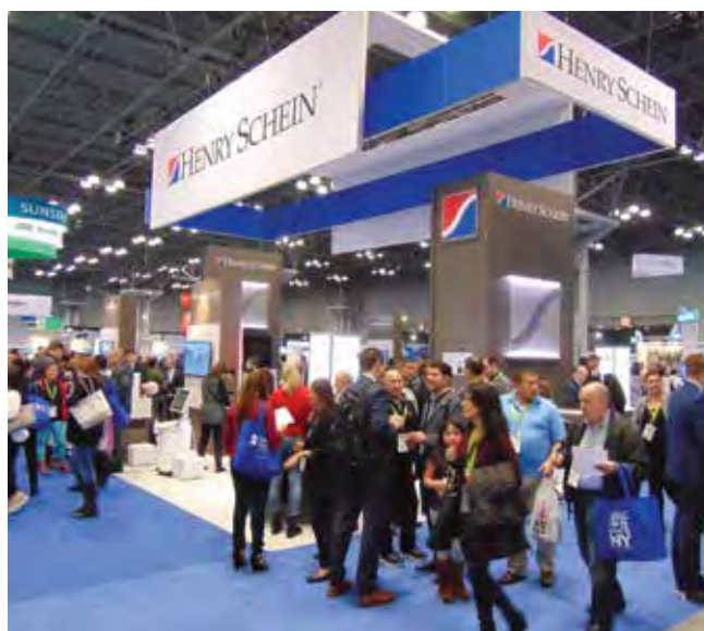
• The Henry Schein Dental booth (No. 4225).