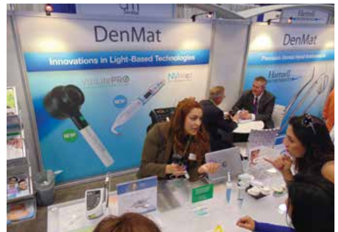
• Company reps share product information with meeting attendees Sunday afternoon at DenMat (booth No. 4127).