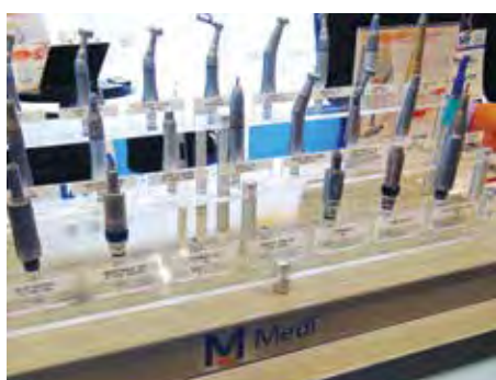
• Handpieces on display at Medidenta (booth No. 916).