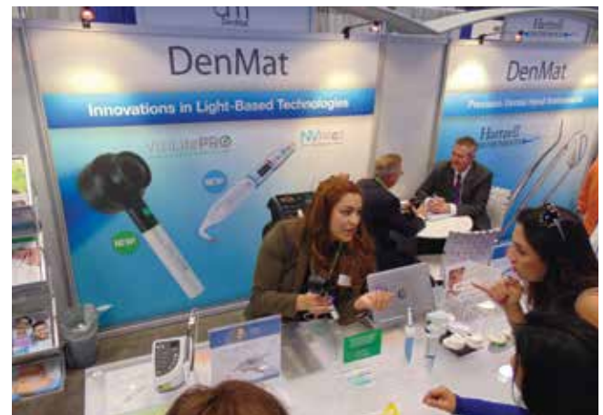
• Company reps share product information with meeting attendees Sunday afternoon at DenMat (booth No. 4127).