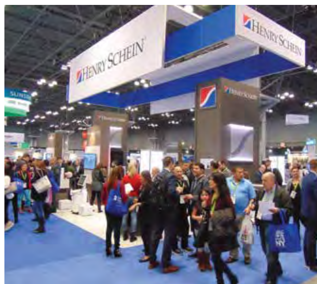
• The Henry Schein Dental booth (No. 4225).