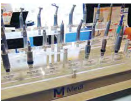
• Handpieces on display at Medidenta (booth No. 916).