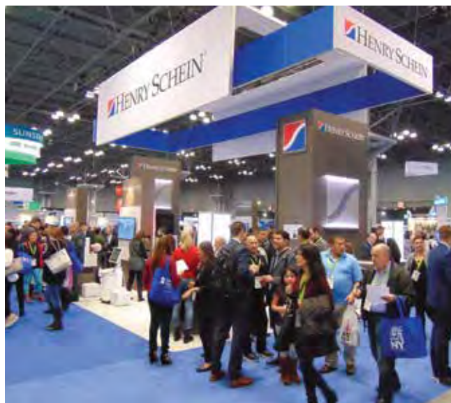
• The Henry Schein Dental booth (No. 4225).