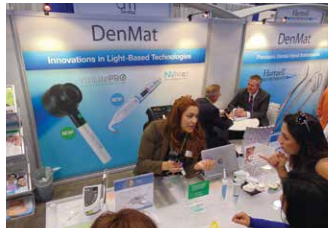
• Company reps share product information with meeting attendees Sunday afternoon at DenMat (booth No. 4127).