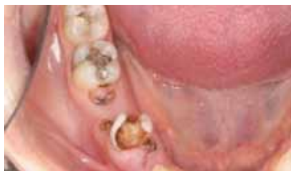
Fig. 1: Initial treatment

Well, it has happened to all of us at one time or another. The perfect analogy to use and consider, especially when speaking to patients, is the outer surface of the hand versus