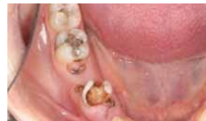
Fig. 3: Pre-op

the palm of the hand. Both are skin, but which one is tougher? Obviously, the palm is.