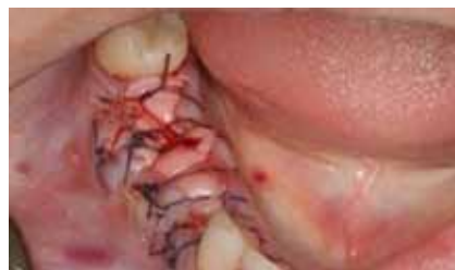
Fig. 2: Initial treatment