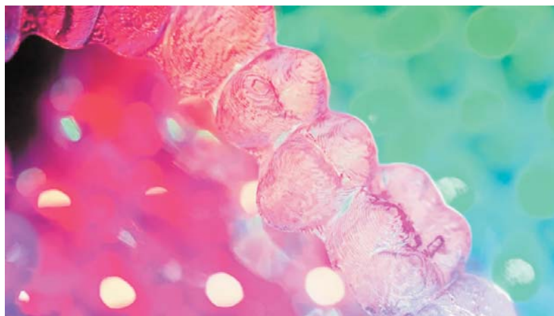
Several research projects in Scandinavia have focused on improving the oral health of adolescent patients.