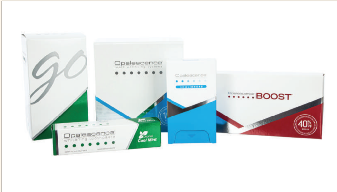
Opalescence PF Whitening for Aligners

Ultradent 505 West Ultradent Drive South Jordan, UT 84095 Web: www.ultradent.com