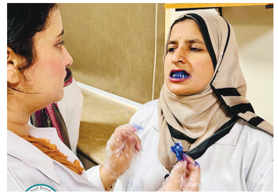
Students engaging in practical demonstrations to improve their oral cleaning practices and maintain optimal oral health.