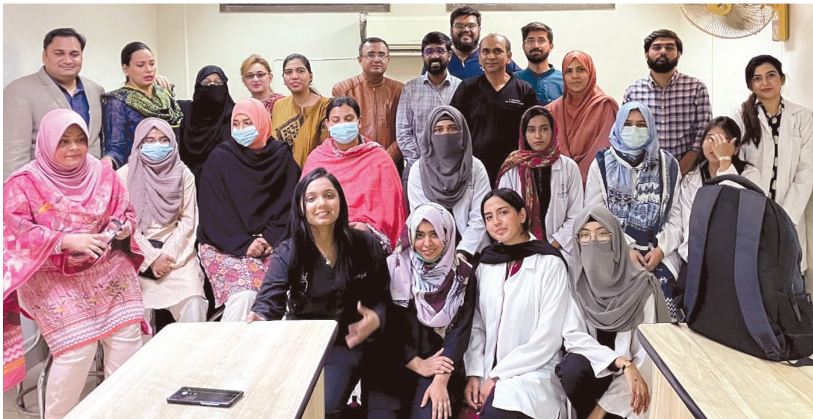
Snapshot of workshop participants with the facilitator and senior faculty, all in high spirits.

KARACHI: Karachi Medical and Dental College (KM&DC), Karachi Medical University (KMU), recently concluded a Basic Surgical Skills Workshop, designed to enhance the surgical techniques of dental professionals.