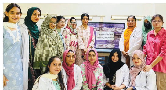
Group photo of Poster Competition participants.