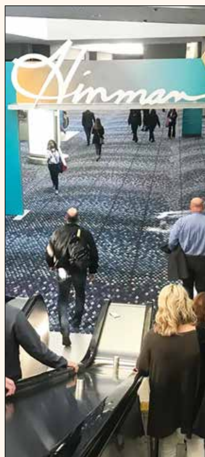
Attendees enter the Hinman Dental Meeting during a previous show. This year, the meeting is being held Thursday, March 16 to Saturday, March 18.