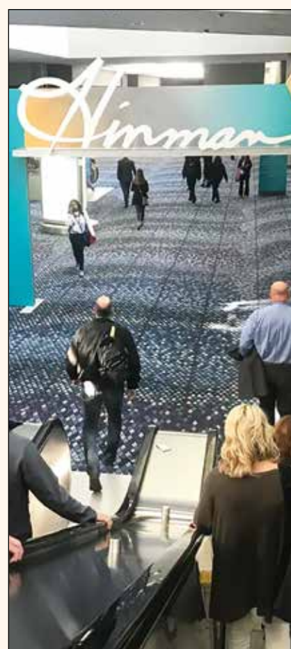
Attendees enter the Hinman Dental Meeting during a previous show. This year, the meeting is being held Thursday, March 16 to Saturday, March 18.