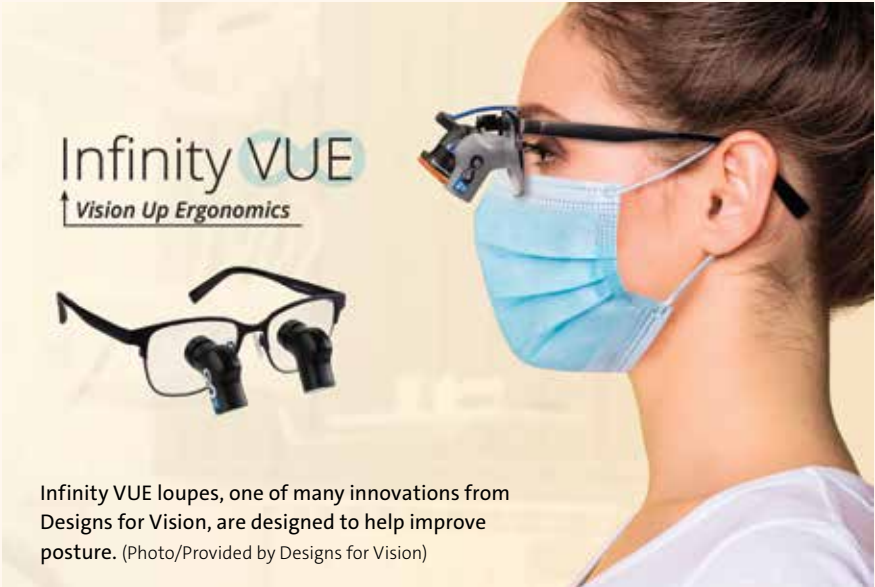
Infinity VUE loupes, one of many innovations from Designs for Vision, are designed to help improve posture.

finity VUE is available in 3.0x, 3.5x and 4.5x magnifications. Designs has also added the Micro 3.0EF to the award-winning Micro Series Loupes. The Micro 3.0EF has a field of view of 100 mm and weighs less than 70 grams. The Micro Series includes REALITY 5 Star rated Micro 3.5EF Scopes and Micro 4.5EF Scopes, utilizing a revolutionary optical design that reduces the size of the prismatic telescope by 50 percent and reduces the weight by 40 percent while providing an expanded field view of the oral cavity. Designs for Vision is also introducing patented (US pat. 8,851,709 & RE46,463) hands-free infrared technology with the WireLess IR HDi and the Micro IR HDi headlights. The patented IR feature allows you to operate the headlight