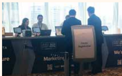
Attendees register during the 2022 ADSO Summit, held in Austin, Texas.

lenges, the ADSO recently launched a Workforce Task Force comprised of ADSO member companies and dental industry partners. The task force will investigate issues impacting recruitment and retention and provide recommendations to help dental practices meet their staffing needs.