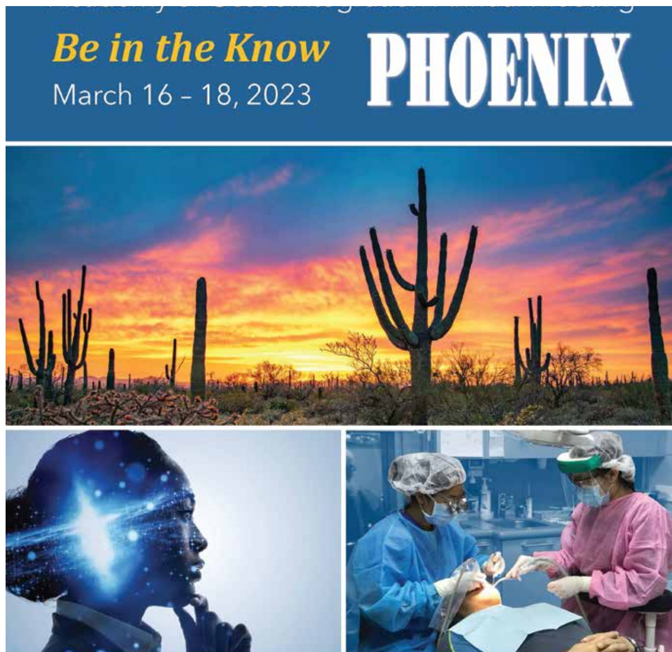
Head to Phoenix this March for the Academy of Osseointegration's 2023 annual meeting.

In case you miss a session, most will be