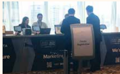
Attendees register during the 2022 ADSO Summit, held in Austin, Texas.

lenges, the ADSO recently launched a Workforce Task Force comprised of ADSO member companies and dental industry partners. The task force will investigate issues impacting recruitment and retention and provide recommendations to help dental practices meet their staffing needs.