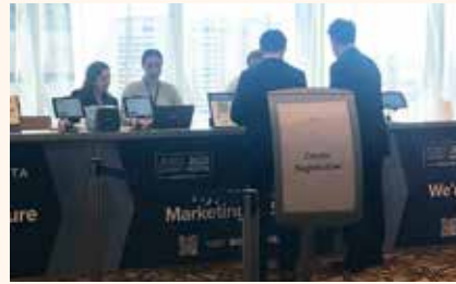
Attendees register during the 2022 ADSO Summit, held in Austin, Texas.

lenges, the ADSO recently launched a Workforce Task Force comprised of ADSO member companies and dental industry partners. The task force will investigate issues impacting recruitment and retention and provide recommendations to help dental practices meet their staffing needs.