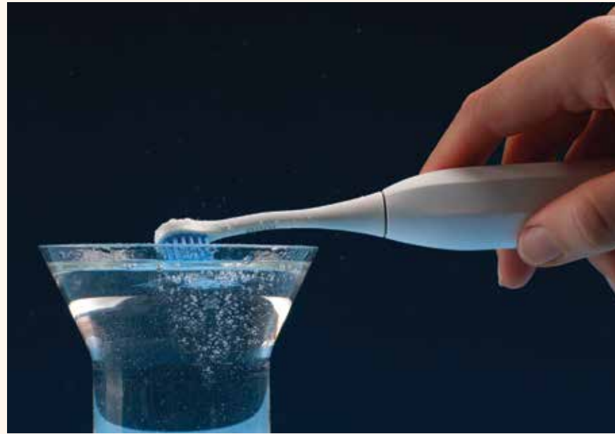
The Curaprox Hydrosonic Pro is light, compact, practical, gentle and offers better results, according to the company behind it.

reached with CURACURVE ergonomics on all three brush heads. CURACURVE is