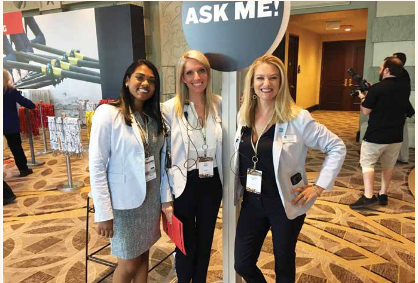
It's all smiles at a past year's Florida Dental Convention. This year's meeting features cutting-edge education, social events and a packed exhibit hall.