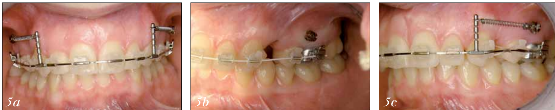
Figs. 5a–c: Space closure in the region of the upper anterior teeth. En masse retraction with the aid of miniscrews and a Power Arm (FORESTADENT), which has been crimped here (a). Status after extraction of the premolars, showing OrthoEasy miniscrew (b). The Power Arm is used as a sliding mechanism, in order to distalize the canine further (c).