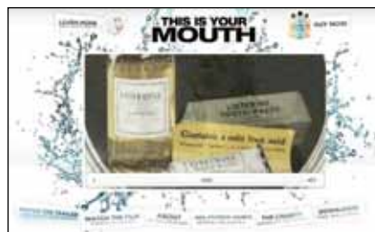
A screenshot of www.listerine.com/yourmouth .

Each time the documentary is viewed, a $1 donation will go from Johnson & Johnson to the National Children’s Oral Health Foundation: America’s Toothfairy.