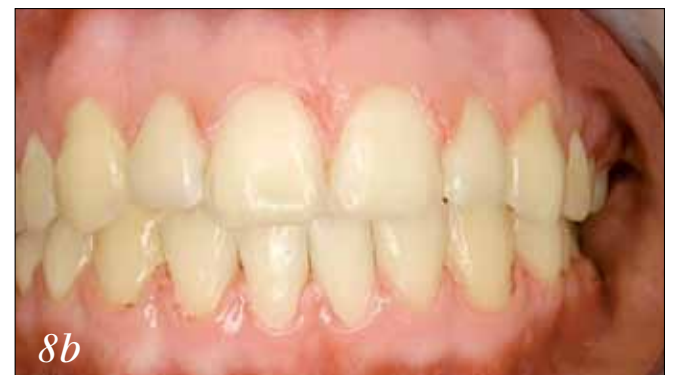
Figs. 8a, b: Extrusion in order to close an open bite caused by tongue thrust, with deterioration of the upper jaw. The aim was to extrude the upper frontals over the miniscrew in the lower jaw (a). Status after 12 months (b).