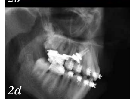
Figs. 2a-d: Distalization of the upper laterals. Miniscrews were inserted in the paramedian region (OrthoEasy, FORESTADENT) (a). OrthoEasy with attached laboratory abutments (b). The Frog Appliance was lashed to the laboratory abutments (c). Lateral X-ray showing the ideal positioning of miniscrews, laboratory abutments and Frog Appliance (d).