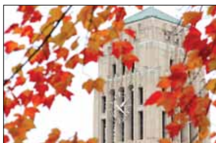
The University of Michigan Campus in Ann Arbor.