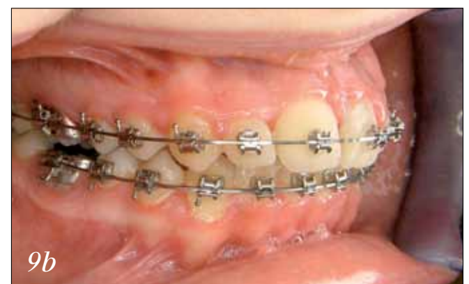
Figs. 9a, b: Intrusion in order to close a tongue and skeletal open bite. Intrusion of the molars was effected using a Titanol Uprighting Spring (FORESTADENT) (a). Status after six months (b).

shorter space of time than in the case of the upper anterior teeth. The opposing bone in the lower jaw prevented this undesirable reactive effect.