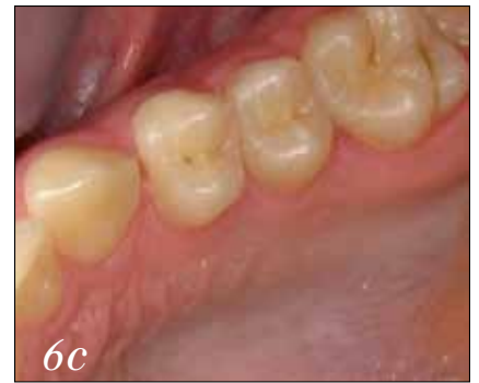
Figs. 6a–c: Space closure in the region of the upper laterals. Baseline situation: Teeth #25 and #27 are free of caries (a). Using miniscrews (OrthoEasy, FORESTADENT), it is possible to provide ‘invisible’ treatment (b). Very few elements are required for mesialization (c).