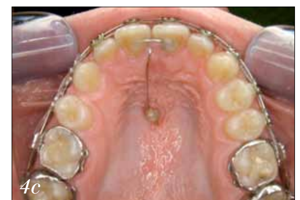
Figs. 4a-c: Space closure in the region of the upper anterior teeth. Diagram showing the anchorage principle (a). Baseline situation: The central frontal teeth were held in place using a steel arch (19 x 25) fixed to a miniscrew with additional frontal dental torque (b). After nine months, the anchorage is stable (c).