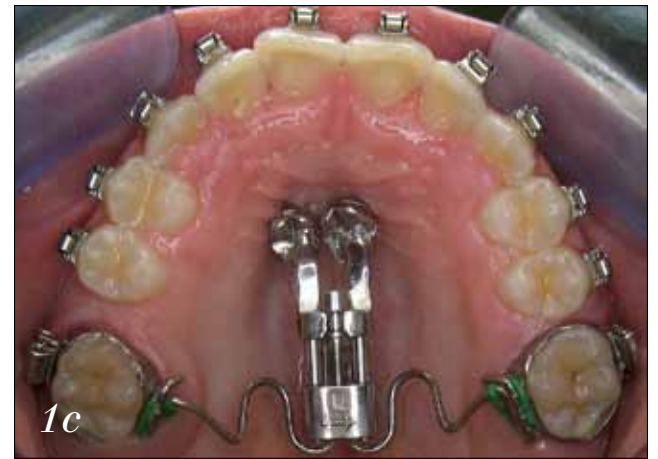
Figs. 1b, 1c: Walde Frog Appliance (FORESTADENT) anchored to two miniscrews (b). Distalization by approximately 6 mm after three months' treatment, providing sufficient space for the correct repositioning of the canines (c).

the correction of the anterior displacement of teeth and particularly of jaw segments. It might seem that the availability of miniscrews means that conventional appliances no longer need to be used at all.