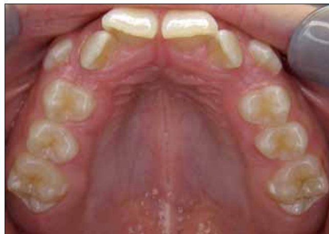
Fig. 1a: Distalization of the upper molars. Mesial positioning of teeth #16 and #26, showing clear displacement of the canines.

The two treatment options in such a case are extraction or distalization. In this case, distalization