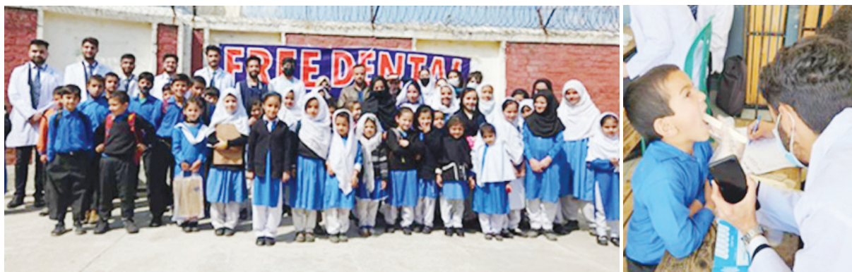
The AIMI Department of Preventive & Community Dentistry Team! Here's a snapshot of team alongside school children. On the right, a child who underwent oral examinations and received personalised treatment.

ABBOTTABAD: The Abbottabad International Medical Institute (AIMI) Department of Preventive & Community Dentistry teams, in collaboration with Colgate, visited a total of 17 schools in Abbottabad, where they conducted a comprehensive oral examination of 10,550 children, providing their personal treatment plans and a free treatment card, as part of its community outreach programme for 2023.