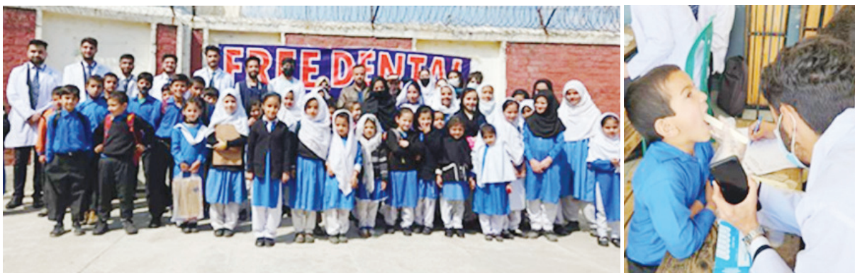
The AIMI Department of Preventive & Community Dentistry Team! Here's a snapshot of team alongside school children. On the right, a child who underwent oral examinations and received personalised treatment.

ABBOTTABAD: The Abbottabad International Medical Institute (AIMI) Department of Preventive & Community Dentistry teams, in collaboration with Colgate, visited a total of 17 schools in Abbottabad, where they conducted a comprehensive oral examination of 10,550 children, providing their personal treatment plans and a free treatment card, as part of its community outreach programme for 2023.