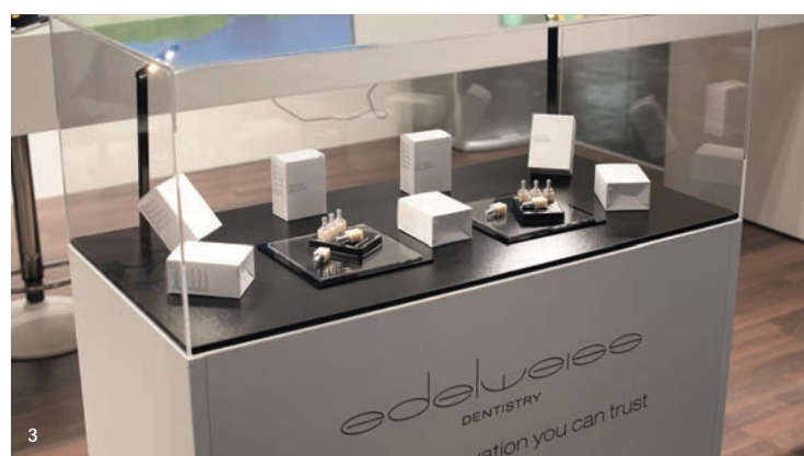
3 The newly launched edelweiss CAD/CAM BLOCK showcased at IDS. 4 The edelweiss dentistry booth at IDS 2023.

More information on the edelweiss dentistry products can be found at www.edelweissdentistry.com . ◀