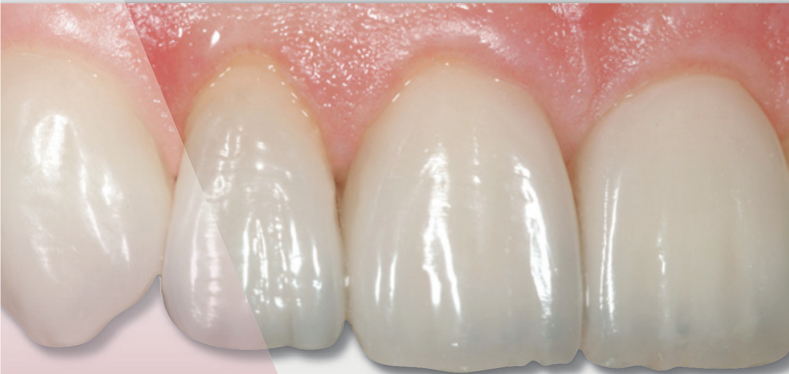
6 direct veneers in upper front teeth: Body i2 & Azur Effect & Skin White

05 SHADING TECHNOLOGY DOUBLE CONSISTENCY SURFACE GLOSS ERGONOMICS