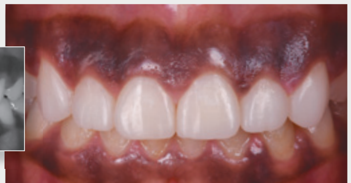
Form enhancement of 6 anterior teeth: Body i1 & Skin Bleach