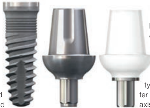
Fig. 1: Implants and abutments used (left to right). blueSKY implant, SKY esthetic abutment titanium, SKY elegance abutment.

Bone loss around the implant always occurs when an abutment is connected to a dental implant at the crestal level. It has been demonstrated that the gap between the implant and the abutment has a direct effect on bone loss, regardless of whether the two parts are connected at the time of integration of the implant or later. 5 This phenomenon occurs whether the implant is loaded or not and appears to be unrelated to the type of implant surface. 5,6 Hermann et al. demonstrated that crestal bone remodels to a level about 2.0mm apical to the implant-abutment junction (IAJ), 5,7,8 while Lazzara and Porter reported crestal bone levels about 1.5 to 2mm below the IAJ at one year after restoration. 9 Tarnow et al. documented a horizontal component that results in 1.3 to 1.4mm of resorption from the IAJ to the bone in a horizontal direction. 10,11 When the biologic width is in the wake of such osseous changes, the soft-tissue architecture, including the appearance of the papillae, is affected. The interproximal bone influences the interdental papillae by acting as a guidepost for the soft-tissue contours.