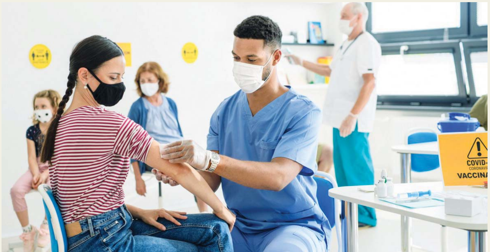
A German dentist was harshly criticised on social media platforms for putting pressure on his dental team to receive the COVID-19 vaccine. However, in the opinion of political leaders and ethics councils, a compulsory vaccination for healthcare workers could be possible in the near future.