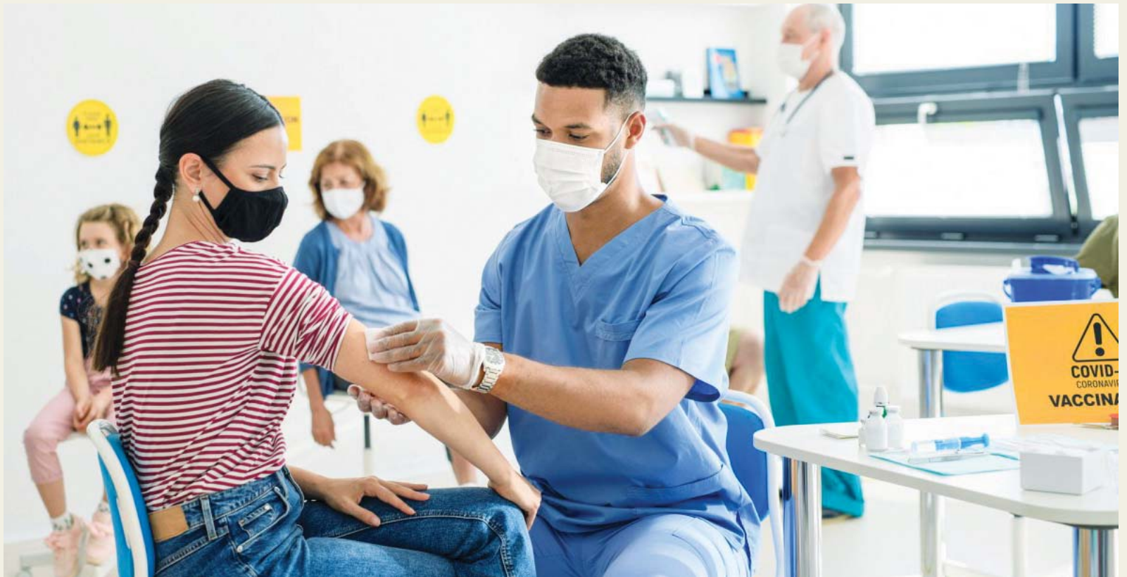
A German dentist was harshly criticised on social media platforms for putting pressure on his dental team to receive the COVID-19 vaccine. However, in the opinion of political leaders and ethics councils, a compulsory vaccination for healthcare workers could be possible in the near future.