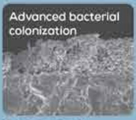
Advanced bacterial colonization