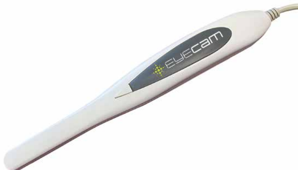
• The new EyeCam.

More information will be available at Shofu's booth, No. 1128.