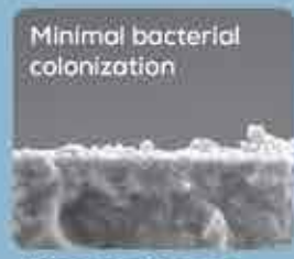
Minimal bacterial colonization

*8-Year independent clinical study recorded 100% retention rate, no secondary caries, failures, or postoperative sensitivity.