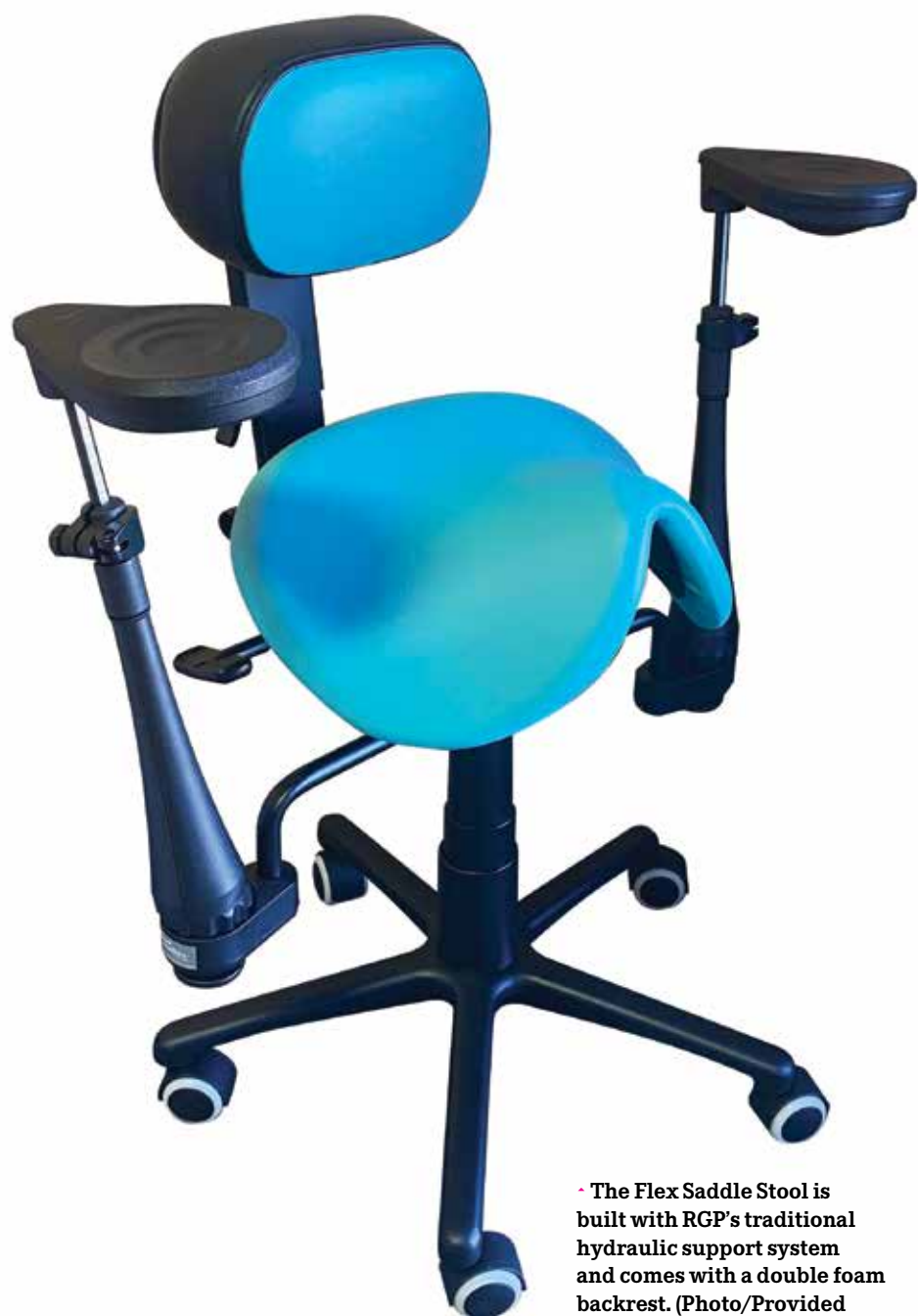
• The Flex Saddle Stool is built with RGP's traditional hydraulic support system and comes with a double foam backrest.