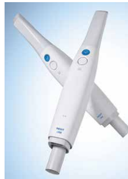
• The new i700 wireless intraoral scanner.

For more information about Medit products and software, visit Medit’s official website, www.medit.com .