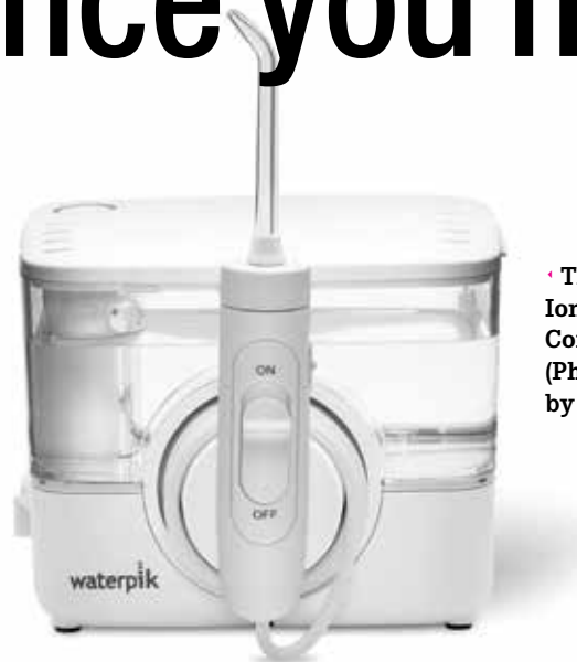
• The Waterpik Ion Professional Cordless Model.

higher settings, research has shown that even on the highest pressure settings, the Waterpik Water Flosser is safe on the gingival tissue and epithelial attachment.