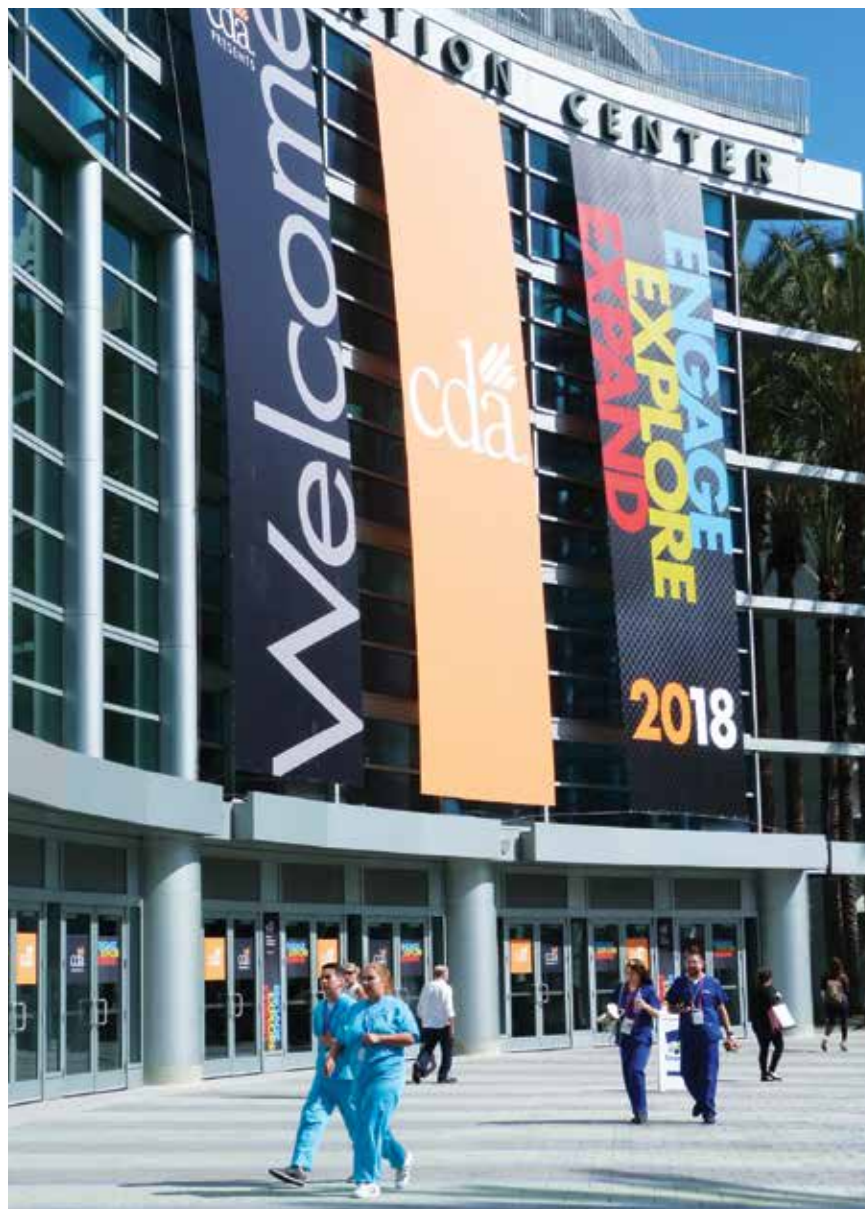
• Attendees head into the Anaheim Convention Center during a past CDA Presents The Art and Science of Dentistry. This year’s meeting goes until Saturday.